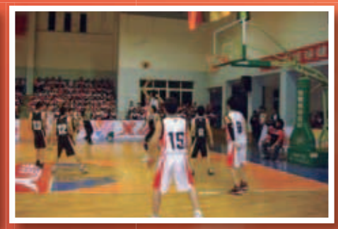
Sole title sponsor of Zhejiang Secondary Student Basketball League