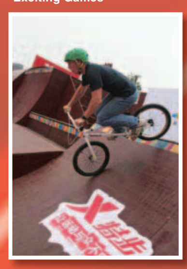
Sole title sponsor of Xtep CX National Games