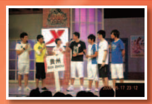
Sole title sponsorship of "Progressing Everyday" of Hunan Satellite TV