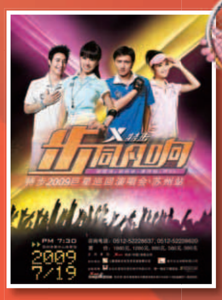
2009 Xtep Stars Nationwide Concert Tour