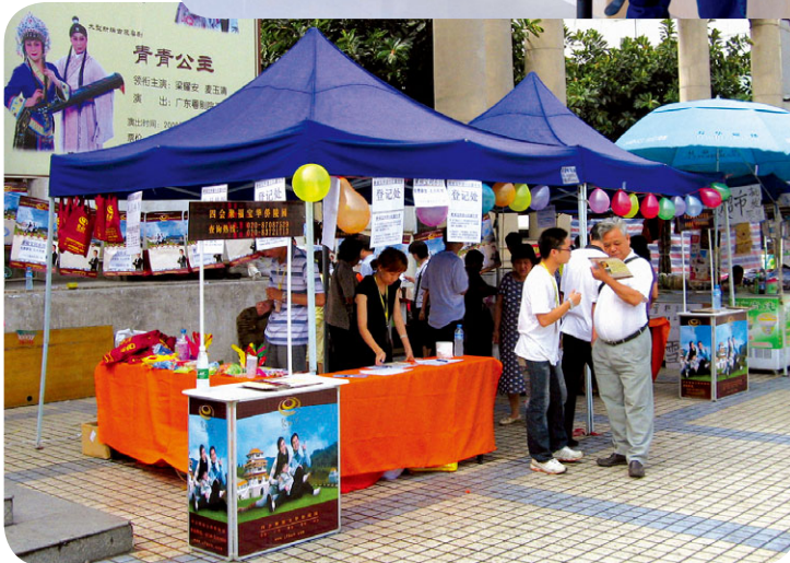
Promotional activity in Guangzhou