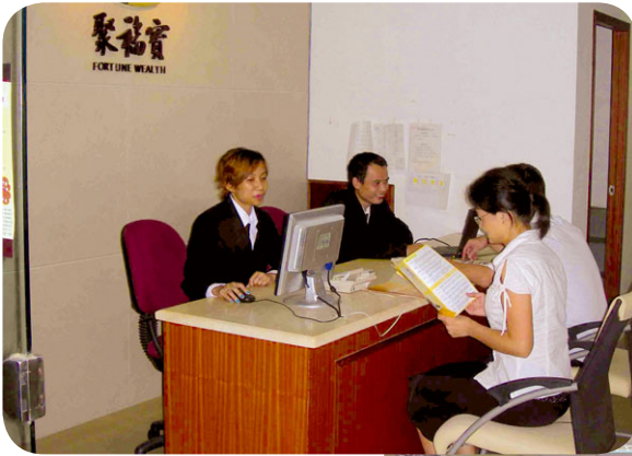
Tianhe District, Guangzhou