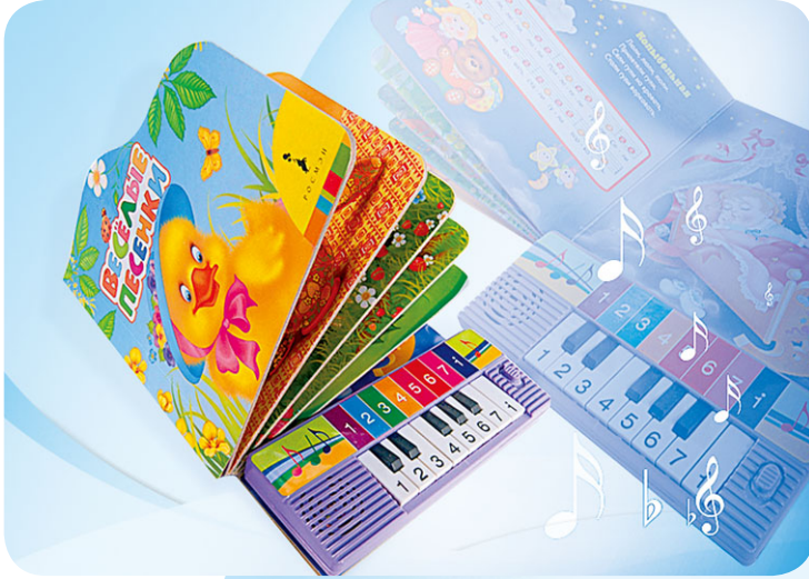
Book plus product