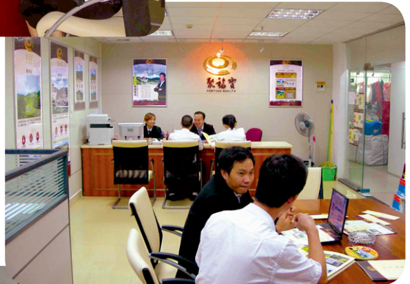
Yuexiu District, Guangzhou