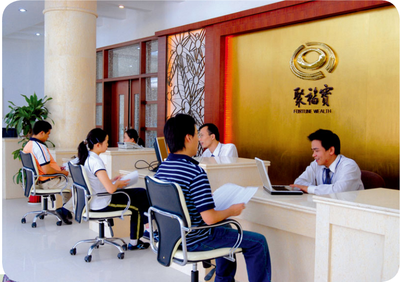
Fortune Wealth Memorial Park