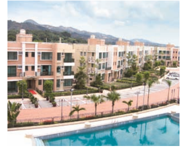
Deep Bay Grove