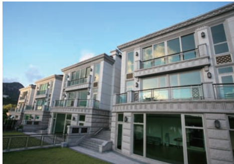
33 Island Road