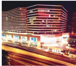
New World Centre