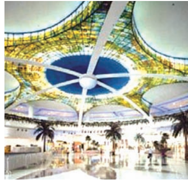
Discovery Park Shopping Mall