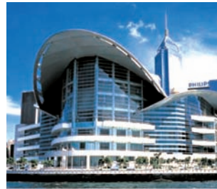
Hong Kong Convention and Exhibition Centre