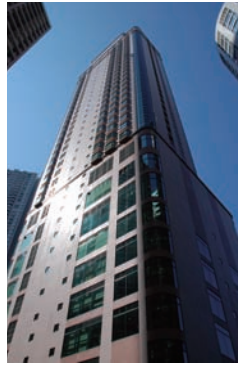
2 MacDonnell Road