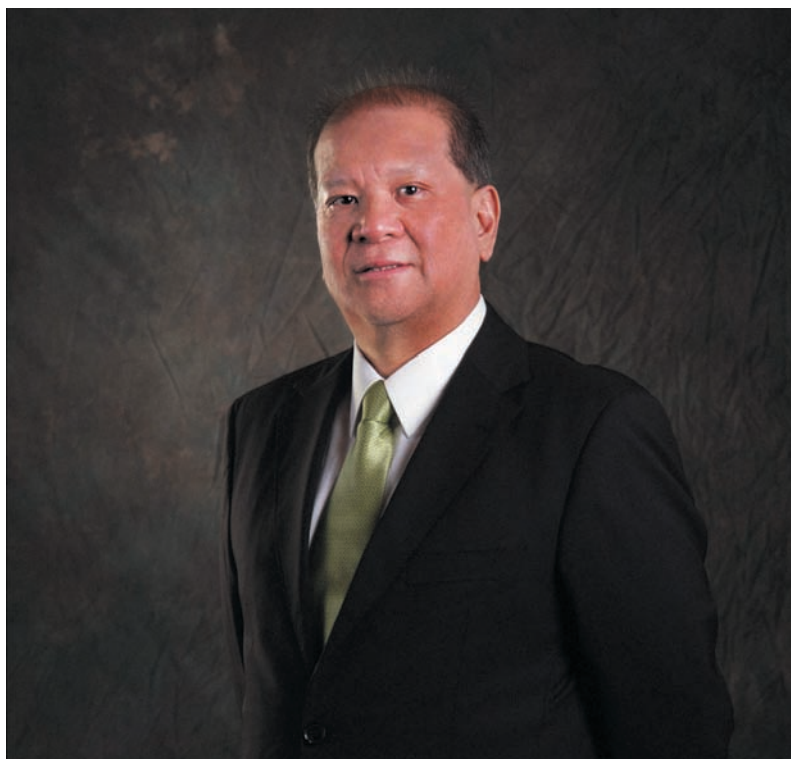
Ramon S. Ang 蔡啟文 Chairman 主席