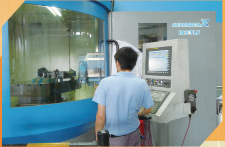
精密五軸深孔加工中心正在進行模架運水孔加工 Coolant hole drilling of a mould base on a precision 5-axis deep hole drilling center