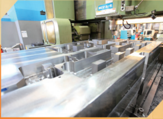
大型精密龍門式加工中心正在加工一件汽車配件模板 Machining of a mould plate for an automotive mould on a high precision double column machining center