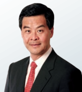
The Honourable LEUNG Chun Ying