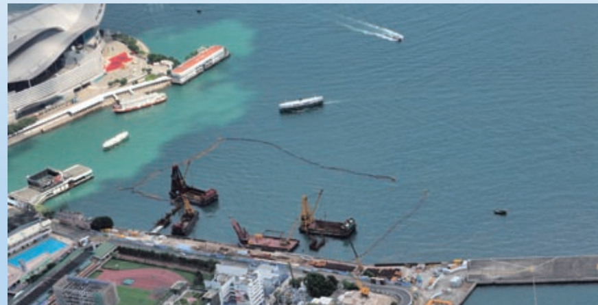
Wan Chai Development Phase II – Central-Wanchai Bypass at Hong Kong Convention and Exhibition Centre & at Wan Chai East