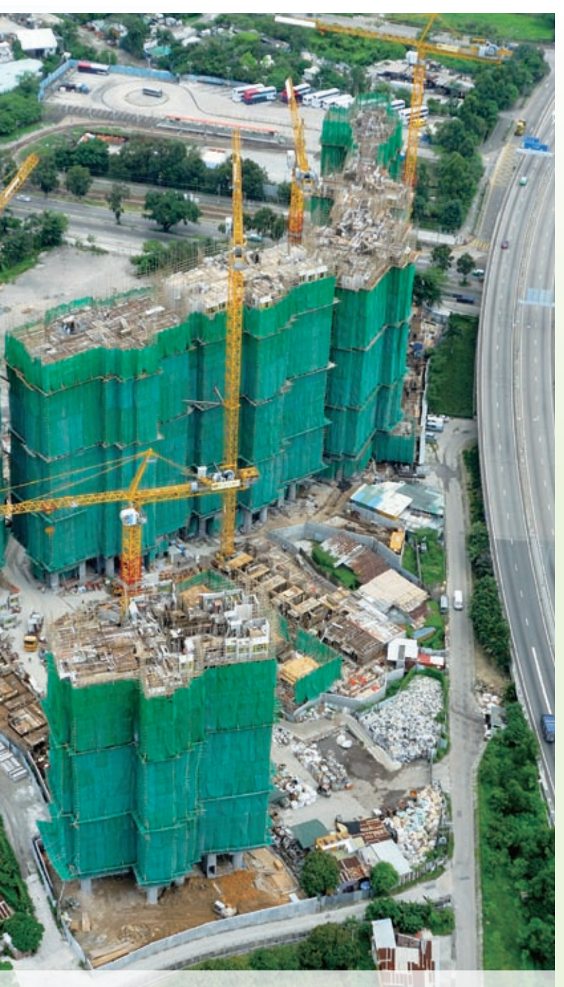
Carcass works for proposed residential development at Hung Shui Kiu, Yuen Long