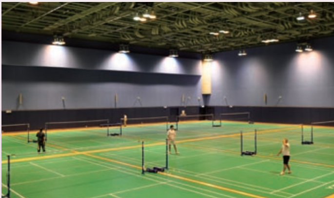
Redevelopment of The Hong Kong Sports Institute Contract 1 Works and Temporary Velodrome in Whitehead, Shatin

E & M services for the redevelopment for The Hong Kong Sports Institute and the temporary velodrome in Whitehead, Shatin