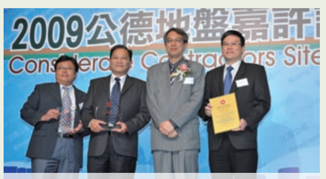
"Merit Award of Outstanding Environmental Management & Performance Award" from the Considerate Contractors Sites Award Scheme

The Group's property services subsidiary has extended its business scope to provide maintenance services to properties which are managed by MTRC. The subsidiary was awarded a contract from Modern Terminals Limited as the exclusive contractor to provide security services for all of its ports in Hong Kong. By adopting cost management measures and reinforcing efforts on market penetration during the financial year, the subsidiary was able to achieve growth in turnover and profit.