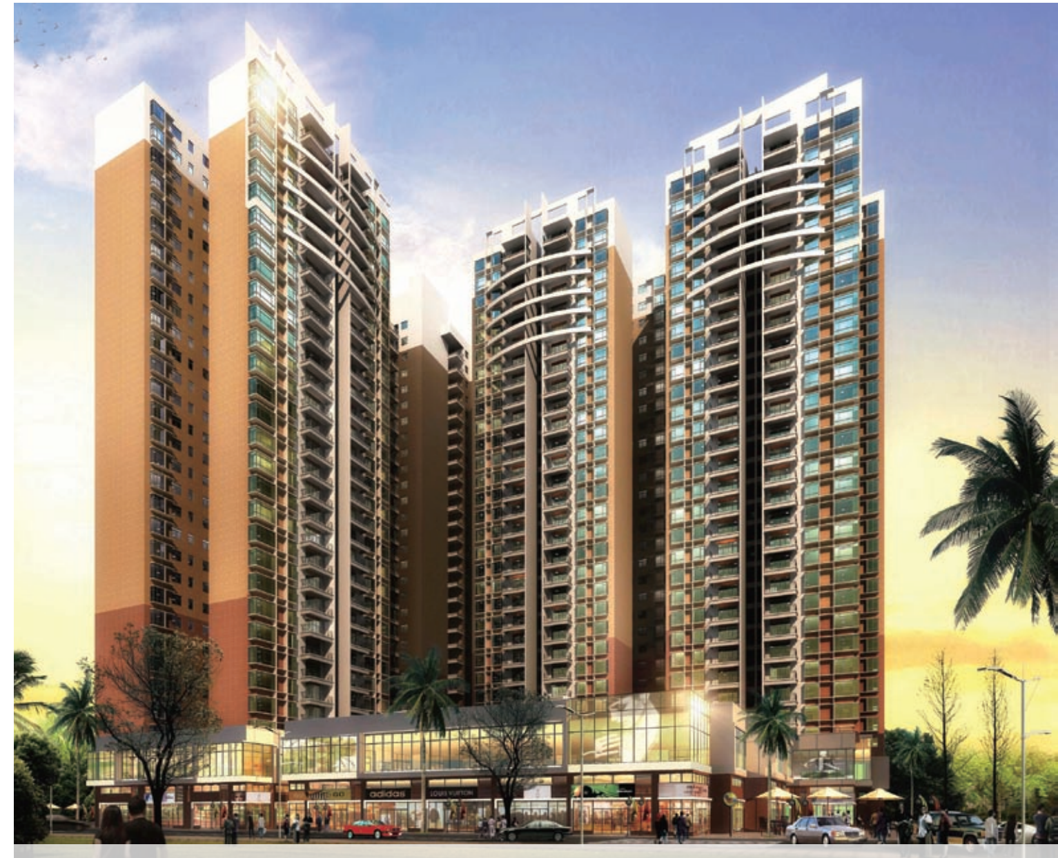
Perspective of Shanwei Commercial and Residential Development Project