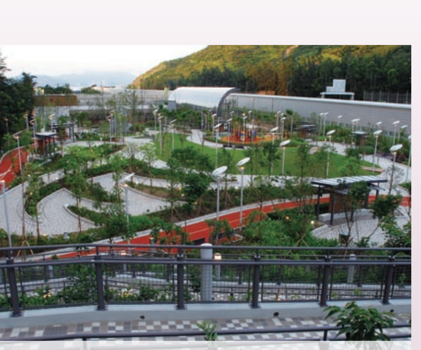
E&M services at District Open Space in Tung Chung