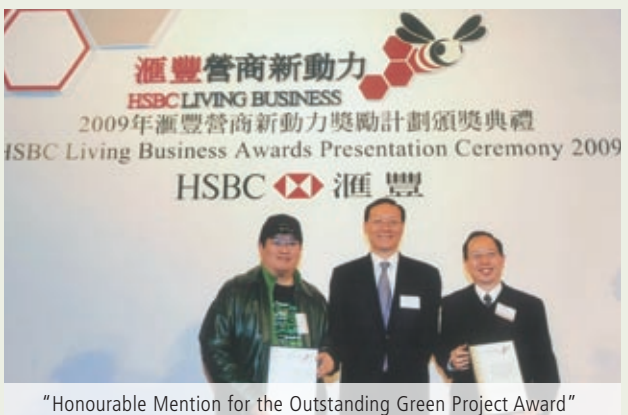
"Honourable Mention for the Outstanding Green Project Award" of HSBC Living Business Award 2009

The Group has partnered with Hong Kong Young Women's Christian Association ("HKYWCA") for a 3 year program to sponsor the HKYWCA Tin Shui Wan (North) Family Wellness Center. The Centre provides preventative family services including initiating activities for families and kids. The Group also provides assistance to the Society for Community Organization ("SOCO") in supporting the unemployed and under-employed family members of low-income families.