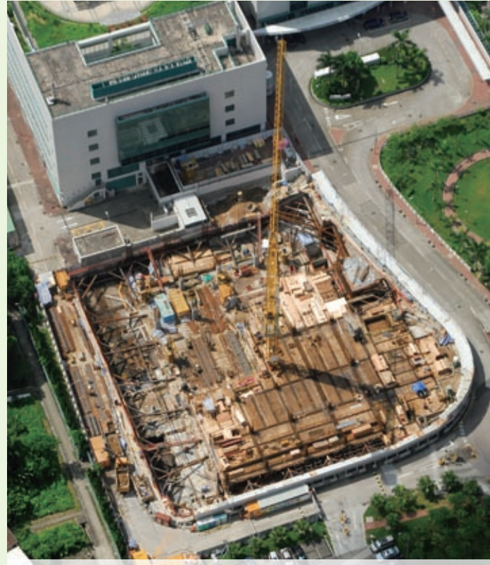
Design and Construction of Expansion of Tseung Kwan O Hospital