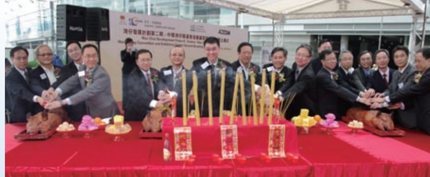
Ground Breaking Ceremony of Wan Chai Development Phase II - Central-Wan Chai Bypass at Hong Kong Convention and Exhibition Centre