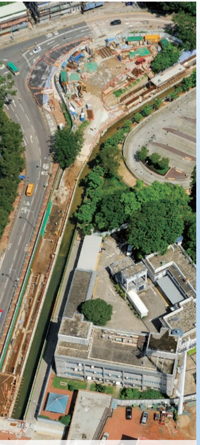
Improvement of Fuk Man Road Nullah, Sai Kung