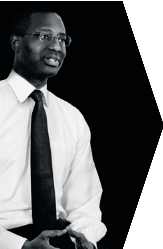
Tidjane Thiam Group Chief Executive