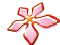
Singapore Service Star 2010 (by Singapore Tourism Board) 新加坡服務之星2010 (由新加坡旅遊局頒發)