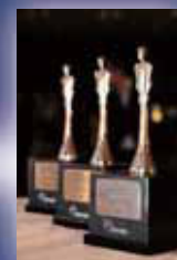
Won the DSA/OYSA for 7 consecutive years