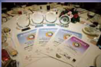
Won CRE Awards for 3 consecutive years