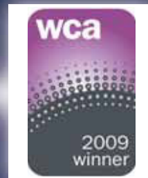
World Communication Award – The Best Managed Service, 2009