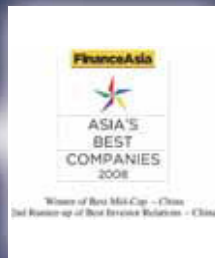
Awarded by Finance Asia as – 1st in “Best Mid-Cap” (China) – 3rd in “Best Investor Relations” (China)