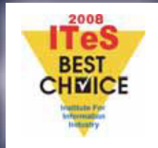
ITes Best Choice Award, 2008