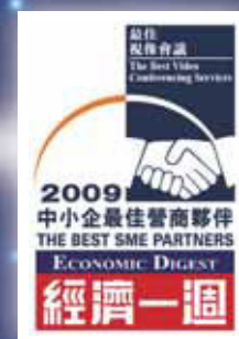
The Best SME Partners – The Best Video Conferencing Services, 2009