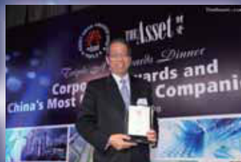
The Asset Corporate Award Ceremony, 2009