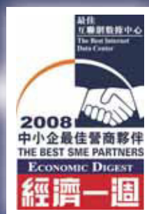
The Best SME Partners – The Best Internet Data Centre, 2008