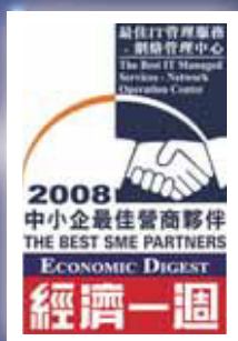
The Best SME Partners – The Best IT Managed Services – NOC, 2008