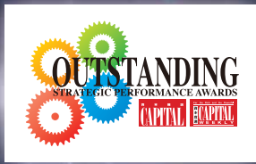
Outstanding Strategic Performance Awards, 2009