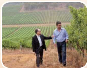
CHALLENGER WINE TRUST Australia Vineyard business