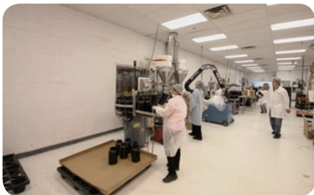
Vitaquest’s versatile manufacturing capability comprises a wide selection of product formats, including tablets, capsules, powders, liquids, creams and lotions.

With an impressive library of research papers at its disposal, Lipa is able to substantiate label claims across a broad spectrum of actives and conditions. The professional service allows Lipa to have a substantial impact on market penetration, specifically in the therapeutic areas of joint health, cardiovascular health and antioxidants.