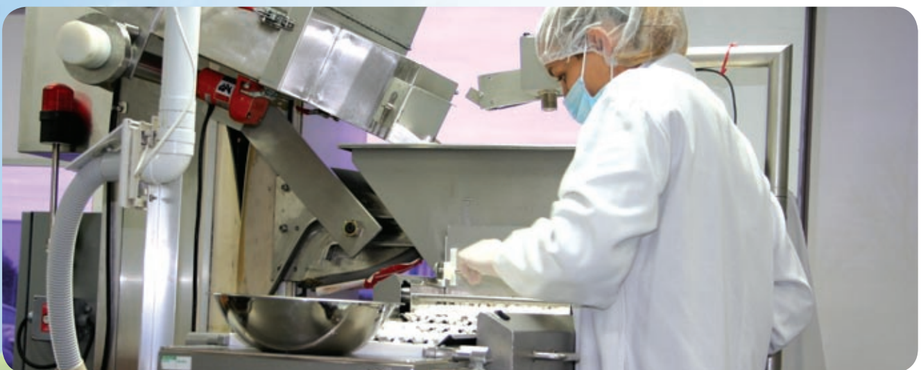
Using a combination of antigens from three proprietary melanoma cell lines, Polynoma's POL-103A vaccine stimulates the body's immune system to fight cancer cells.

Using a combination of antigens from three proprietary melanoma cell lines, Polynoma's POL-103A vaccine stimulates the body's immune system to fight cancer cells. A Phase II randomized, double-blind, placebo-controlled study has demonstrated that there was a statistically significant improvement in recurrence-free survival in patients with resected Stage III melanoma treated with the vaccine.