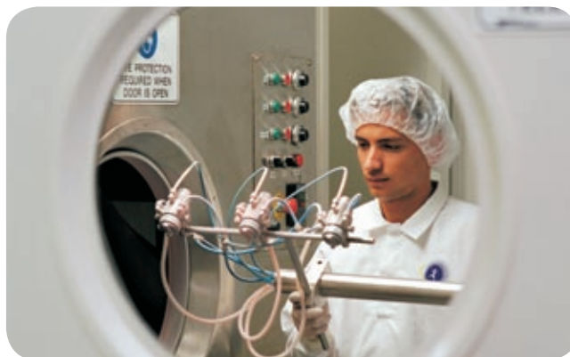
Supplying over 30% of the Australian market, Lipa is the country’s leading contract manufacturer of complementary healthcare medicines, vitamins and nutritional supplements.