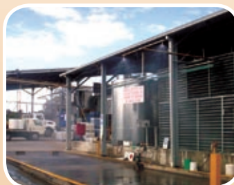
ACCENSI Australia Toll manufacturing of crop protection products