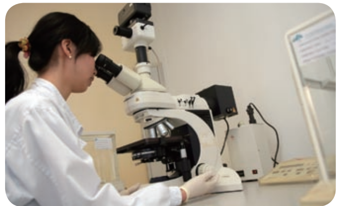
Two pharmaceutical inventions of the Life Sciences Research Institute are progressing steadily in late-stage clinical development.