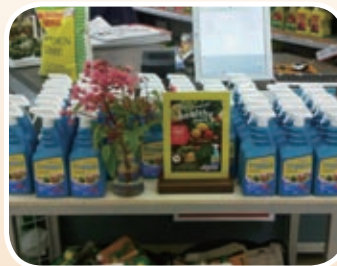
ECOFERTILISER GROUP Australia Eco-fertiliser businesses