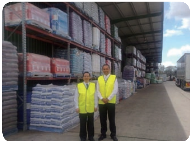
The Ecofertiliser Group's key markets comprise recreational turf, amenity horticulture, production horticulture, broadacre agriculture and home garden.

The expansion of storage capacity and reconfiguration of Accensi's manufacturing facilities in Queensland have resulted in better costs and higher operational efficiency, as well as minimised need for outside storage.