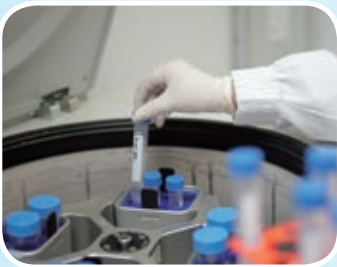
LIFE SCIENCES RESEARCH INSTITUTE Hong Kong Cancer treatment R&D