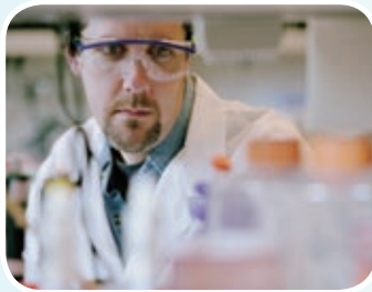
POLYNOMA United States Melanoma vaccine research