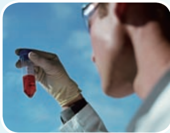
WEX PHARMA Canada Pain management product research