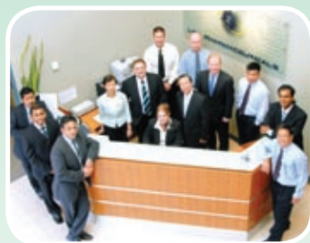
LIPA Australia Custom contract manufacturing