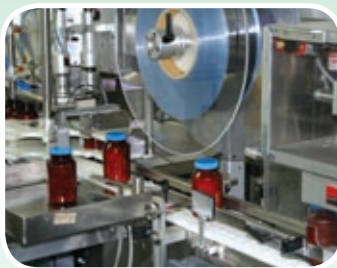
SANTÉ NATURELLE A.G. Canada Marketing and distribution of nutraceuticals