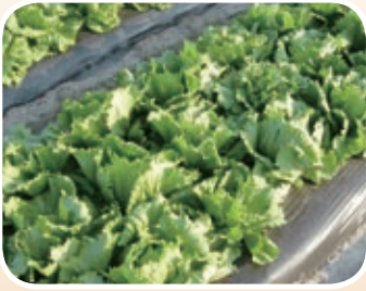
GREEN VISION China Fertiliser business