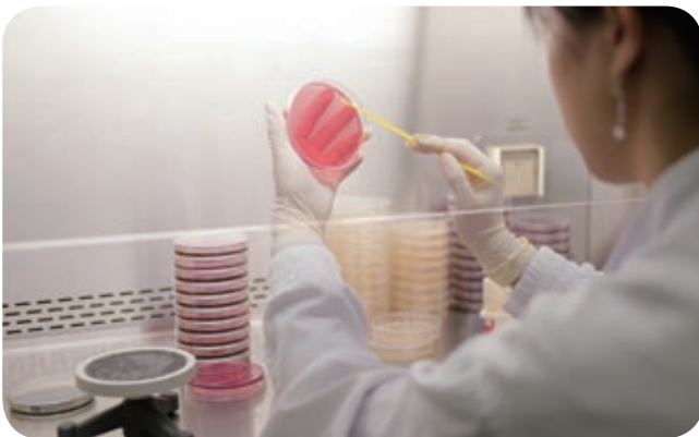
The Life Sciences Research Institute carries out the Company's pharmaceutical R&D initiatives.

In 2010, a new joint venture, Renascence Therapeutics, was also established to develop intranasal medications focused primarily on the China market.