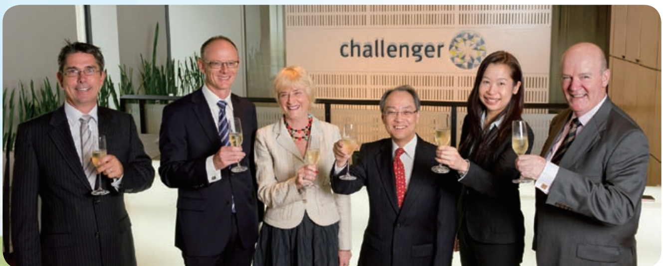
CK Life Sciences acquired Challenger Wine Trust, the second largest vineyard owner in Australasia, further strengthening its agriculture-related business.

With an attractive asset portfolio and a solid tenant base, CWT's vineyard assets provide immediate and recurring cashflow to CK Life Sciences.