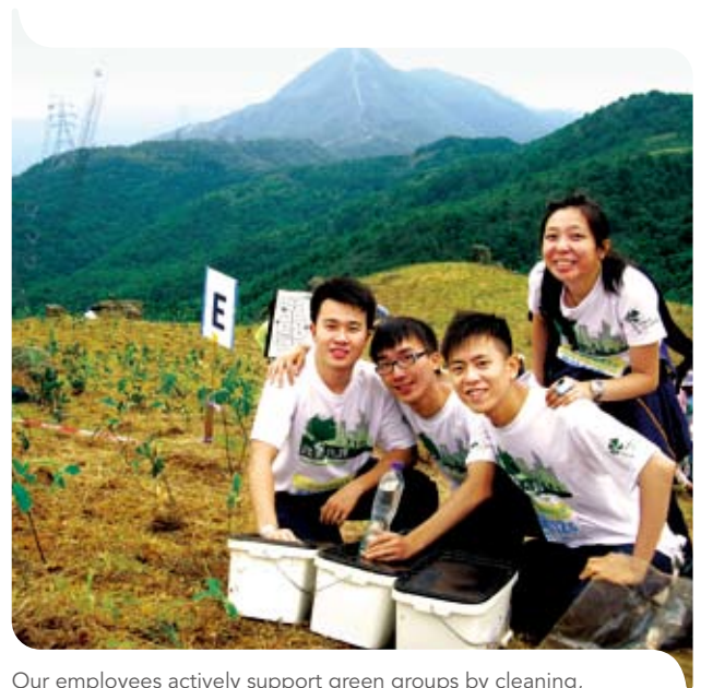
Our employees actively support green groups by cleaning, replanting and protecting natural environments.

Our employees take a keen interest in green programmes such as the annual 'Clean Up the World in Hong Kong' by Green Power, the 'Tree Planting Challenge' by FoE, and mikania removal work organised by the Conservancy Association.