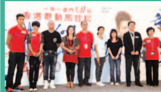
Hong Kong Dance Marathon 2010 香港舞動馬拉松2010