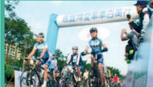
HSBC Pok Oi Cycle for Millions 2010 滙豐博愛單車百萬行2010