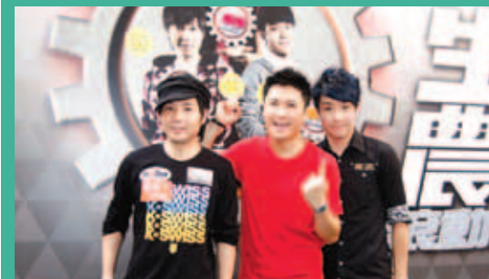
Life Fama Tour 生命農夫