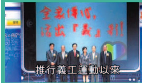
2010 Hong Kong Volunteer Award Presentation Ceremony 2010 香港義工嘉許典禮

本集團各員工在瞭解及滿足廣告商需求方面的能力，令路訊通盡佔優勢。致力栽培人才對本集團穩守其領導地位至為重要。在二零一零年財政年度，本集團透過招攬人才及提供培訓，提升旗下人員的質素與效率。邁向未來，本集團將繼續深化培訓人才的傳統，上下齊心，迎接未來挑戰。