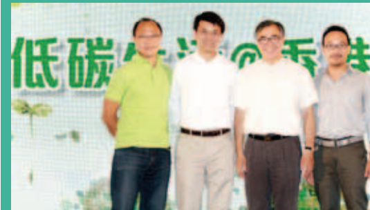
The Climate FootPRINT 低碳生活@香港