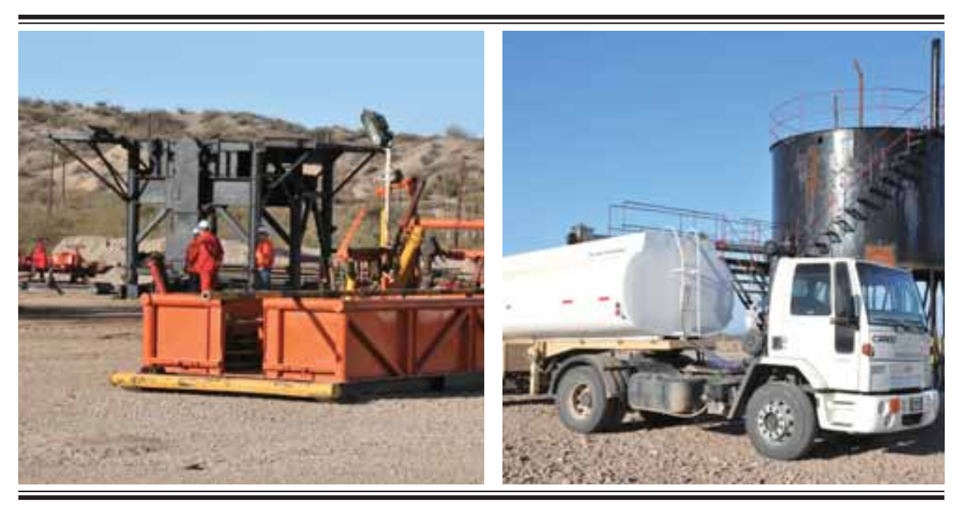
Oil transportation truck

In Mendoza there are three formations that were productive in the past (two shallows and productive – Barrancas and Rio Blanco and one deeper, namely, Potrerillos. The Group has drilled five wells of which three were directed to the shallow formations, namely CH-1052, CH-1053 and CH-1055; and two were directed to the deeper formation, namely CH-7 bis and CH-25 bis. All five wells are producing in the shallow formation. The directors of the Group consider that since the portion of the wells drilled down to the deep