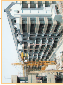
B 區 住宅連商舖