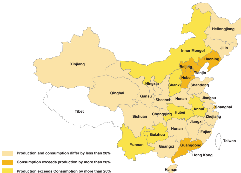
Figure 6.1: Chinese Energy Production and Consumption

China is a vast country and the distribution of energy sources versus electricity demand are greatly unbalanced. Indeed, nearly two thirds of hydro resources and coal reserves are distributed in the Southwest, West, Northwest and North of China while two thirds of electricity loads are in the East and South of China, where there is a lack of electricity energy sources. Figure 6.1 shows the distribution of the electricity production and consumption in China.