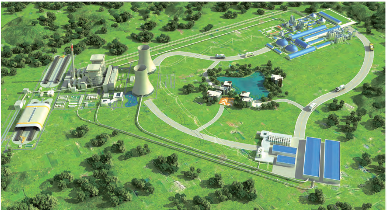
廣西賀州華潤循環經濟產業示範區示意圖 Schematic map of China Resources Hezhou Industry Demonstration Zone of Circular Economy

In March 2011, we participated in the "China Resources Hezhou Industry Demonstration Zone of Circular Economy" project, which is a national level project on circular industry chain jointly established with China Resources Power Holdings Company Limited and China Resources Snow Breweries Limited. The project consists of a cement plant with annual production capacity of 2.0 million tons, a power plant with total installed capacity of 2,000 megawatt and a brewery with annual production capacity of 200,000 tons. The cement plant will provide limestone powder to the power plant for desulfurization, the power plant will supply electricity to the cement plant and the brewery and also steam to the brewery, the brewery will supply recycled water to the power plant whereas all industrial wastes and garbage generated by all the plants will be consumed as raw material for cement production after harmless disposal treatment. Zero discharge of pollutants and water recycling can be achieved within the development zone and a huge amount of land resources is also saved. The cement plant has already commenced operation in May 2010. The two generating units of the power plant are planned to commence operation in June and December 2012 respectively whereas the brewery is expected to commence operation in October 2012. Once the project formally commences full operation and brings significant economic benefits, we will replicate this business model in other areas.