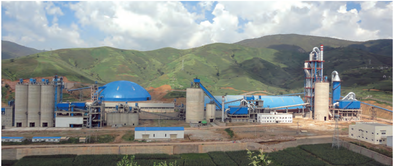
位於雲南彌渡的水泥生產基地 Cement production plant located at Midu, Yunnan

On 26 August 2011, the Company approved the acquisitions of a total of 93.79% effective equity interests in Dali San Teh Cement Co., Ltd. and Dali San Teh Building Materials Industry Co., Ltd. from two independent third parties at the consideration of approximately RMB1,287.1 million (equivalent to HK$1,587.6 million). The companies together operate three 2500 tons per day NSP clinker production lines (annual production capacity of 775,000 tons each) and five cement grinding lines with total annual production capacity of 4.0 million tons in Yunnan. The companies also have a 2500 tons per day NSP clinker production line (annual production capacity of 775,000 tons) and one cement grinding line with annual production capacity of 1.0 million tons under construction in Yunnan. Further amount has been expected to be invested to complete the construction. Please refer to the announcement of the Company dated 26 August 2011 for details of the acquisitions. Subsequently in November 2011, the Company approved the acquisition of additional 3.585% effective equity interests in Dali San Teh Cement Co., Ltd. and Dali San Teh Building Materials Industry Co., Ltd. from independent third parties at the consideration of RMB47.3 million (equivalent to HK$58.3 million). The above acquisitions were completed in December 2011.