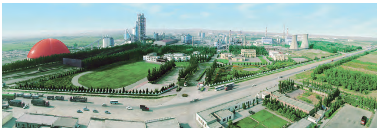
內蒙古蒙西水泥股份有限公司持有位於內蒙古烏海的水泥生產基地 Cement production plant located at Wuhai, Inner Mongolia owned by Inner Mongolia Mengxi Cement Co., Ltd.

On 29 June 2011, the Company approved the acquisition of 40.6% equity interest in Inner Mongolia Mengxi Cement Co., Ltd. from an independent third party at the consideration of RMB1,563.1 million (equivalent to HK$1,928.1 million). Inner Mongolia Mengxi Cement Co., Ltd. operates eight NSP clinker production lines with total production capacity of approximately 29,900 tons per day (total annual production capacity of 9.3 million tons) and twenty two cement grinding lines with total annual production capacity of 12.5 million tons. Inner Mongolia Mengxi Cement Co., Ltd. also has a 5000 tons per day NSP clinker production line (annual production capacity of 1.6 million tons) and two cement grinding lines with total annual production capacity of 2.0 million tons under construction. Please refer to the Company's announcement dated 29 June 2011 for details of the acquisition. The acquisition was completed in July 2011.