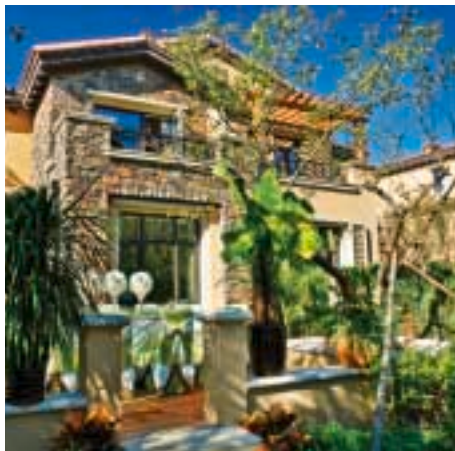
瀋陽澗湖山 Shenyang Rose & Ginkgo Villa

Lastly, on behalf of the Board, I would like to express my sincere appreciation to all of our employees for their hard work and all of our shareholders for their support in the past year.