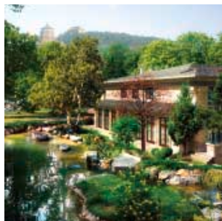
北京頤和原著 Beijing Summer Palace Splendor