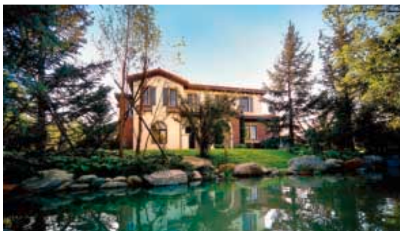
北京瀟灑山 Beijing Rose & Ginkgo Villa

The Directors believe that the continuous improvement of the Group's debt profile and capital structure will act as a strong buffer against market fluctuations and financial risk.