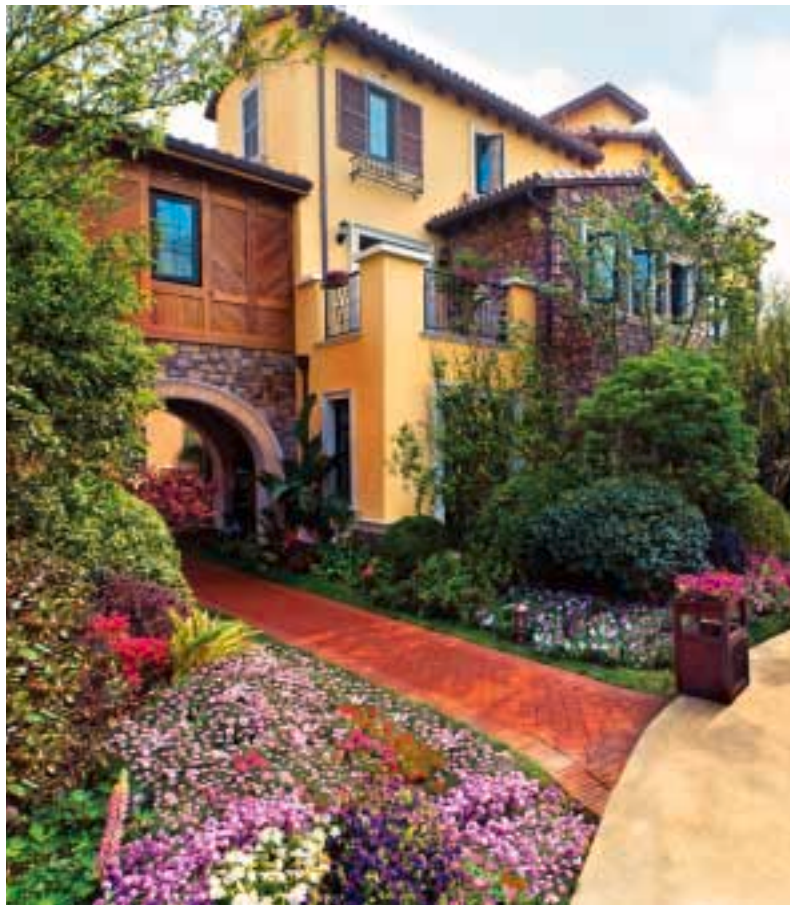
上海好望山城 Shanghai Long Xing Lu