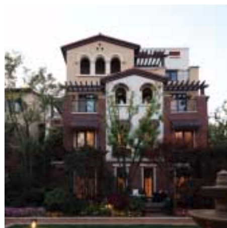
常州原山 Changzhou Dongjing 120 Project