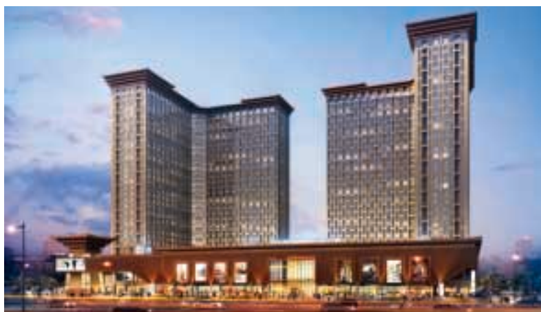
西安MOCO Xi'an MOCO Center

For investment properties, Beijing Starry Street and Chongqing Chunsen Starry Street were completed and commenced operation in 2011, while the construction of five other properties of the Group, namely Chengdu North Paradise Walk, Chongqing U City Paradise Walk Fashion House, Shanghai Sunshine City, Chongqing Times Paradise Walk II and Xi'an MOCO has commenced. Chongqing Times Paradise Walk I, Chongqing U City Paradise Walk Fashion House and Chongqing Chunsen Starry Street II will commence operation in 2012. The above properties ensure a solid basis for the growth of investment property rental income of the Group in the future.