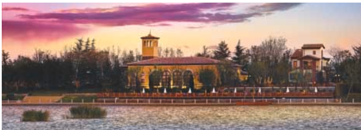
青島瀟灑海岸 Qingdao Rose & Ginkgo Coast

The Group remunerates its employees based on their performance, work experience and the prevailing market wage level. The total compensation of the employees consisted of base salary, cash bonus and share-based rewards. Cash bonus is a large part of senior employees' cash compensation which is a function of, amongst other things, the net profit of the individual subsidiaries, net profit margin, results of a balanced score card system and operating cash inflow, etc. In 2011, the Group granted 46,000,000 share options at the exercise price of HKD12.528 per share and 150,000,000 share options at the exercise price of HKD 8.28 per share to directors, senior management and employees.