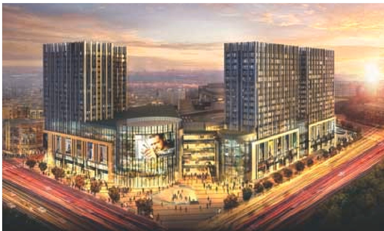
成都北城天街 Chengdu North Paradise Walk

In 2011, revenue from property development of the Group was RMB23.38 billion, representing an increase of 60.1% over last year. The Group delivered 1,934,154 square meters of property in GFA terms, of which 255,994 square meters was contributed from jointly controlled entities. With the delivery of high margin projects such as Beijing Summer Palace Splendor, gross profit margin of property development business rose from 33.3% in 2010 to 40.3% in 2011. Recognized average selling price was RMB13,930 per square meters or RMB11,781 per square meters after excluding the Beijing Summer Palace Splendor project in 2011.