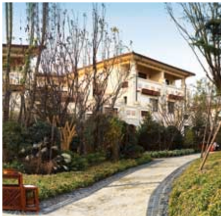
煙台葡醍海灣 Yantai Banyan Bay