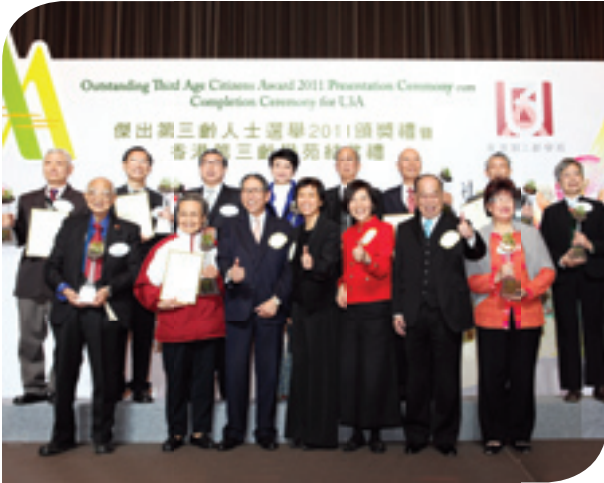
A round of applause for our elderly role models at the 2nd Outstanding Third Age Citizens Award 2011 Presentation Ceremony.

To recognise local retirees who excel in continuous learning, volunteerism and maintaining a healthy lifestyle, the 2nd Outstanding Third Age Citizens Award 2011 Presentation Ceremony was held on 25 March 2011, where 12 senior citizens were commended for being role models.