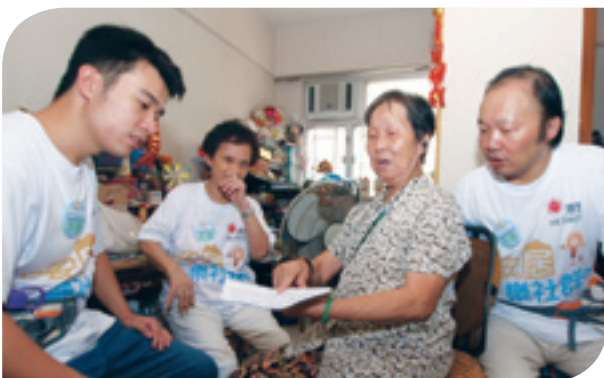
“CAREnival for the Elderly” is part of our unwavering commitment to assist senior citizens and those in need.

Monthly home visits to single elders continued, with elderly volunteers and Power Assets volunteers partnering to extend care to around 600 single elders living in various districts on Hong Kong Island. At the same time, monthly electrical inspections were also held throughout the year to help the elderly inspect their electrical installations at home.