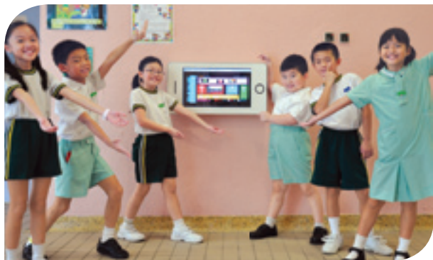
The HK Electric Clean Energy Fund supports kindergartens and schools, enabling the very young to learn about renewable energy and sustainable development as they play.

The Fund was extended to cover kindergartens for the first time in 2011, with eight kindergartens selected for sponsorship, alongside 17 other schools and a university. This followed the recommendations of an independent consultant commissioned to review the operations of the Fund and assess its impact.