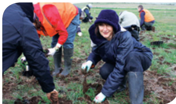
ETSA employees volunteer time and effort to re-establish wildlife habitats and restore vegetation.

ETSA Utilities' Employee Foundation volunteers have been dedicating their time to assist in the revitalisation of Para Woodland Reserve near Gawler. Established in 2003, the 321 hectare reserve is jointly managed by the Department of Environment and Heritage and the Nature Foundation of South Australia. Volunteers have helped in eradicating pest olive plants and revegetation using only local plant species - in an attempt to restore remnant vegetation and help re-establish wildlife habitats.