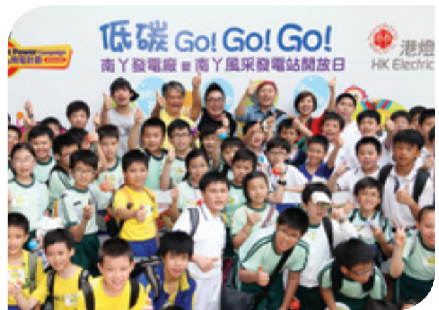
Smart Power Campaign promotes a low carbon lifestyle among youngsters.

The Smart Power Campaign, HK Electric’s programme to promote energy conservation, continued to focus on promoting a low carbon lifestyle in 2011. Special electronic platforms such as mobile applications and a Facebook fans page were introduced to raise public awareness. The “HK Electric Low Carbon App” was launched for free downloads to provide a trendy and easy way to users to learn more about a low carbon lifestyle anytime, anywhere, attracting over 15,000 downloads during the year.