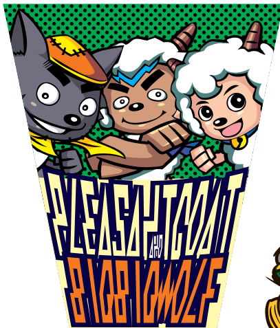
Freedom n Power