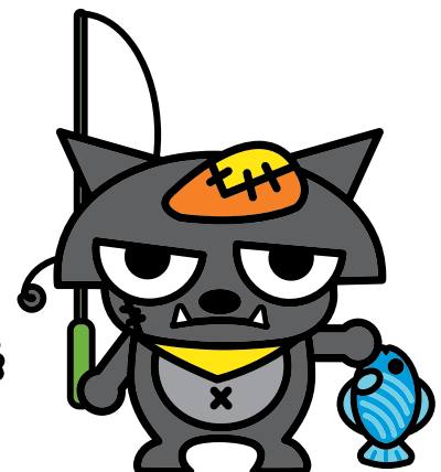
Happy Simple Life