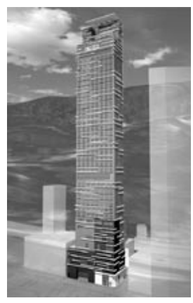
214-room Service Apartment Building Development Project Queen's Road West