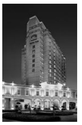
262 guest-room Best Western Hotel Taipa, Macau