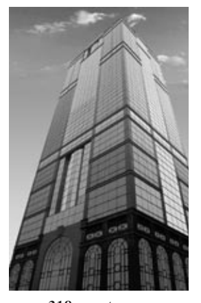
318 guest-room Ramada Hotel Hong Kong