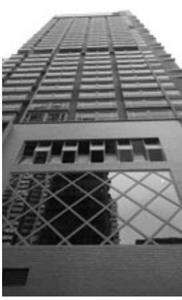
432 guest-room Best Western Hotel Harbour View Queen's Road West