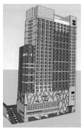
397 guest-room Best Western Grand Hotel Tsimshatsui