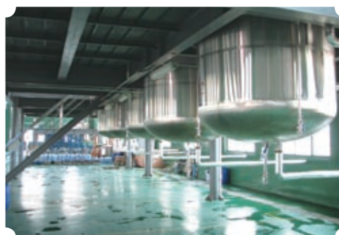
Yingtian Huabao production base 鷹潭華寶生產基地

In addition, Huabao Shanghai received a number of awards in the industry. During the reporting period, Huabao Shanghai was awarded “Top 10 Enterprises of Perfume and Essence in China Light Industries 2010” announced by China National Light Industry Council, reinforcing its leading position in the industry; Huabao Shanghai was granted “Silver Award for Comprehensive Strength in Jiading Industrial Zone 2011”; and the General Manager of Huabao Shanghai also received “Excellent Entrepreneur of Advanced Manufacturing Industry in Jiading Industrial Zone 2011”, which acknowledged the Company’s influence in the local economy development.