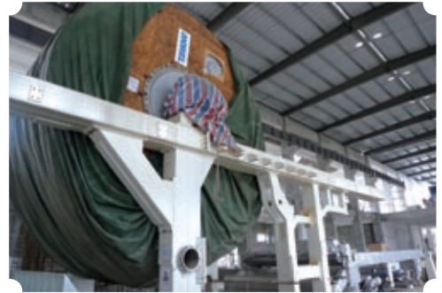
Second phase of Guangdong Jinye production line, mega-size Yankee Dryer 廣東金葉二期生產線，特大型楊克烘缸

於報告期內，集團對廣東金科10,000噸生產線進行了為期一個月的技術改造工作，使其產品的質量、平均售價以及客戶結構得到明顯改善。本次技術改造工作主要是以提高塗布率、穩定產品質量、及改善產品感官質量為目的，通過引用國際水平的技術，優化工藝參數及完善控制系統等手段，對萃取精製、濃縮、制漿、流送造紙及控制等系統進行了改造，使得產品在吃味及香氣量等方面都得到明顯的提高，同時亦提高了產品耐加工性能、穩定了批次間產品質量及同批次產品的均勻性。技術改造後，現時廣東金科的煙草薄片質量在國內達領先水平，已經進入國內部分主流品牌的中高端捲煙產品中，產品質量備受客戶推崇，管理層亦對自進入煙草薄片業務後的總體成績感到滿意。