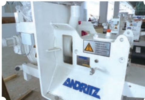
Second phase of Guangdong Jinye production line 廣東金葉二期生產線