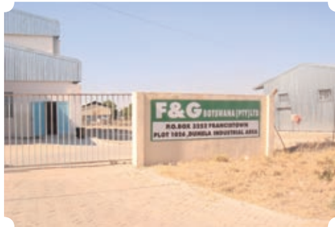
F&G production base F&G生產基地