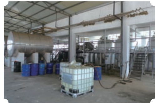
Yunnan Huaxiangyuan production base 雲南華香源生產基地

於本報告期間，雲南華香源的主要產品桉葉油及香茅油獲得高速增長，但因歐債危機使國際市場上桉葉油價格大幅下滑而影響其毛利率；同時新增兩個蒎烯產品，其中 \beta -蒎烯毛利較高，對盈利貢獻較大。完成收購後，通過對雲南華香源的管理流程進行了優化，提高了運營效率。另外，廈門琥珀連續第三年喜獲廈門市「最具成長性中小企業」；而雲南華香源亦以優良的生產經營及技術創新等能力獲得了雲南省楚雄州林業產業第一批「龍頭企業」稱號。在品牌宣傳上，廈門琥珀也頻頻出擊，在二零一一年下旬，分別參加了第六屆中國廈門國際佛事用品展覽會、2011年家庭衛生殺蟲製品專業委員會年會展、而其中2011年中國日用雜品工業協會制香分會年會更是由廈門琥珀主辦。於二零一一年十二月，廈門琥珀更因擁有行業較為先進的儀器設備及高端的研發人才，通過不斷與科研院所積極合作，經過國家科技局有關專家考核和評審論證後，獲批組建「廈門市香料研發重點實驗室」。此重點實驗室的組建，將大大提高廈門琥珀的科研力量，並於將來對整個行業技術水準的提升起到積極作用。