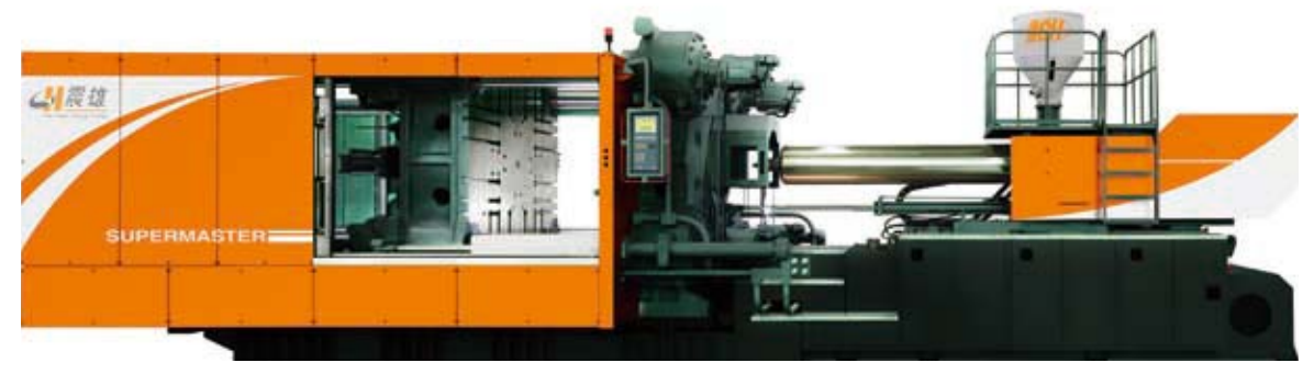
超霸先進系列二板大型節能注塑機 SUPERMASTER Two Platen Advanced Energy-Saving Injection Moulding Machine

The European sovereign debt crisis continued to exert great pressure on China exports, with export growth continuing to slow throughout the second half of 2011. Austerity measures in major European economies and general de-leveraging of the European banking system both significantly hampered capital investments and consumer sentiment, which created further obstacles for the China export sector and also directly affected the Group's sales in Europe.