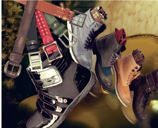
[L2] 2012 autumn collections

The Group offers competitive remuneration packages to our employees based on factors such as market rates, workload, responsibility, job complexity as well as the Group's performance. The Group has also adopted a pre-IPO share option scheme and a share option scheme to recognise, reward and promote the contribution of the employees to the growth and development of the Group.