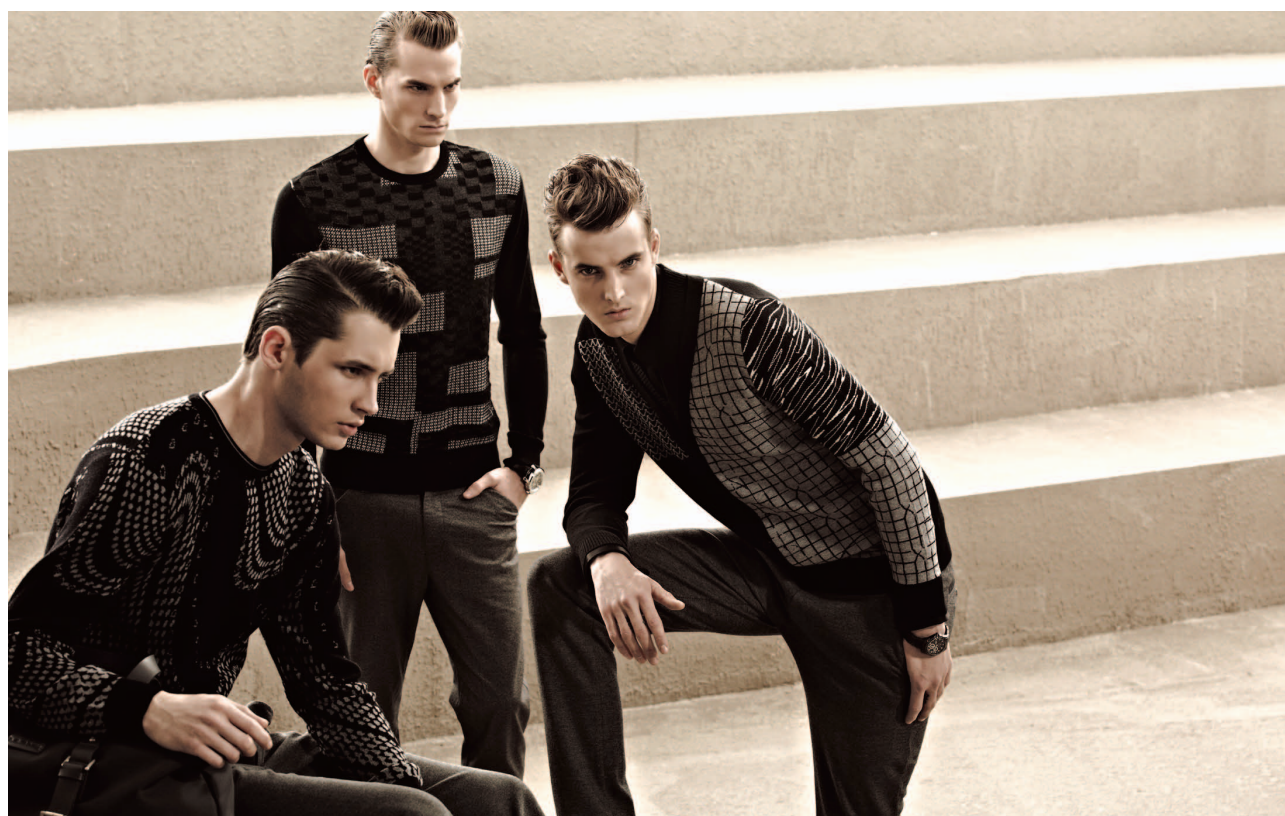
「LILANZ」 2012 autumn collections