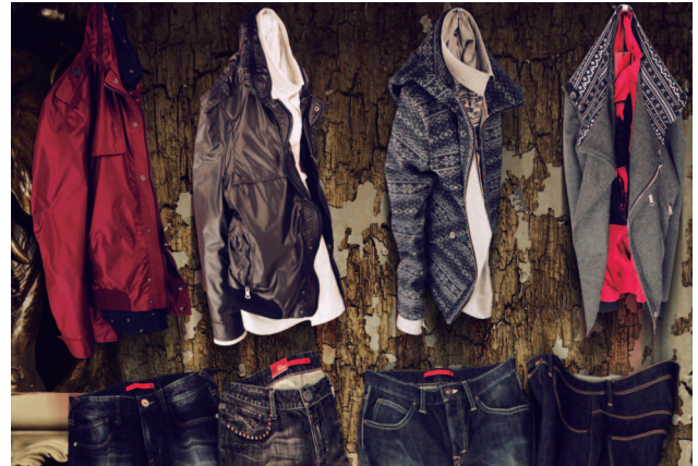
[L2] 2012 autumn collections

As at 30 June 2012, deposits with certain banks totalling RMB310.4 million (31 December 2011: RMB4.0 million) were pledged as securities for bank loans and bills payable.