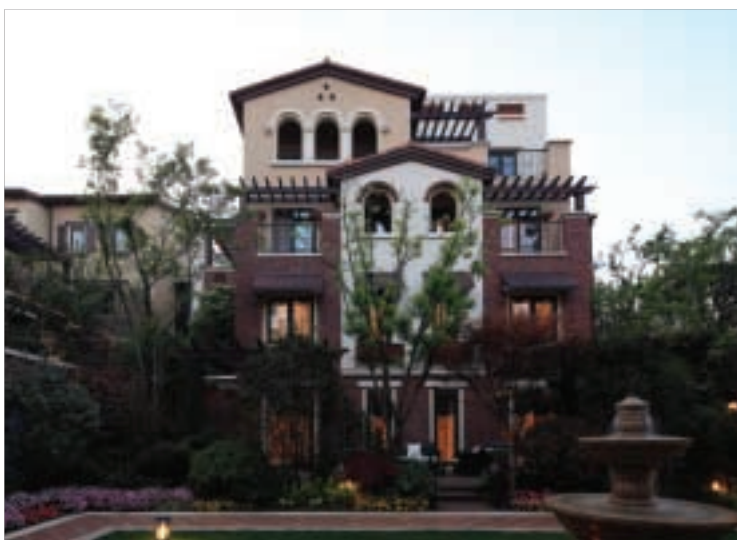
常州原山 Changzhou Dongjing 120 Project