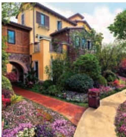
上海好望山城 Shanghai Long Xing Lu

The Group maintains a prudent strategy on property investment. All investment properties of the Group are shopping malls under three major product series, namely Paradise Walk series, which are metropolitan shopping malls, Starry Street series, which are community shopping malls, and MOCO, which are household and lifestyle shopping center. As of June 2012, the Group has investment properties of 438,979 square meters which have commenced operation with an occupancy rate of 98.6%. From January to June 2012, total rental income reached RMB227 million, representing an increase of 34.8% as compared with the corresponding period of last year. The series of Paradise Walk, Starry Street and MOCO, accounted for 79.4%, 16.0% and 4.6% of the total rental respectively, and recorded increases of 30.7%, 47.4% and 77.7% respectively. For the tenant mix of such shopping malls, the GFA of the anchor stores, retail stores, restaurants, recreation stores and stores providing services account for 42.7%, 31.0%, 14.6%, 9.7% and 2.0% of the GFA of Paradise Walk series, respectively, while those for Starry Street account for 0.9%, 37.9%, 30.8%, 23.5% and 6.9% of the GFA, respectively.