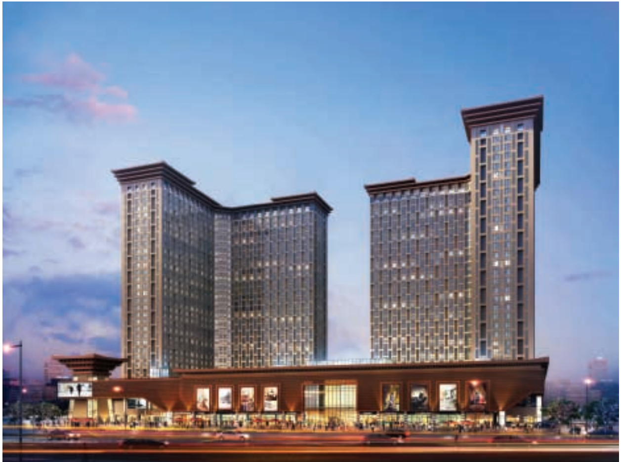
西安MOCO Xi'an MOCO Center

Lastly, on behalf of the Board, I would like to express my sincere appreciation to all of our employees for their diligence and all of our shareholders for their support over the past half year.