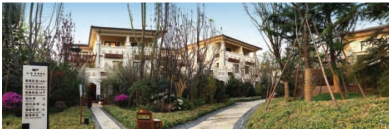
煙台葡醍海灣 Yantai Banyan Bay

For investment properties, Chongqing Times Paradise Walk I and Chongqing University City Fashion Hall will commence operation in the second half of 2012. Chengdu North Paradise Walk, Shanghai Sunshine City Starry Street and Xian MOCO, will commence operation in 2013. The constructions of Chongqing Time Paradise Walk Phase II and Beijing Changying Paradise Walk, which are planned to commence operation in 2014 to 2015, have been started. These projects lay a solid foundation for the future growth in rental income from investment properties of the Group.