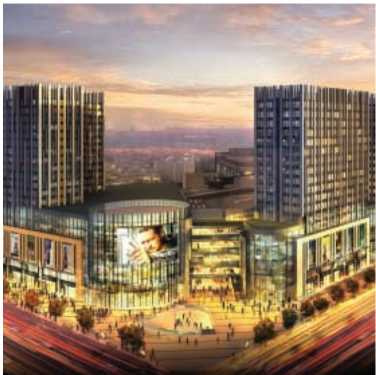
成都北城天街 Chengdu North Paradise Walk