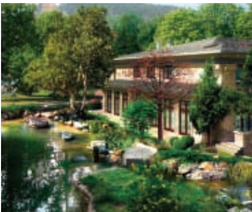
北京頤和原著 Beijing Summer Palace Splendor