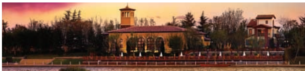
青島灘海岸 Qingdao Rose & Gingko Coast