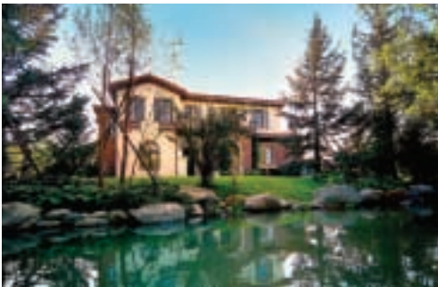
北京瀟灑山 Beijing Rose & Ginkgo Villa

From January to June 2012, revenue from property development business of the Group was RMB14.13 billion, representing an increase of 87.2% over the corresponding period of last year. The Group delivered 1,198,338 square meters of property in GFA terms, of which 75,496 square meters belonged to jointly controlled entities. Gross profit margin of overall property development business decreased slightly to 46.0% as compared with the corresponding period last year. The decrease was attributable to the recognition of projects with high gross profit margin such as Summer Palace Splendor during the same period last year. Recognized average selling price was RMB12,586 per square meter from January to June 2012.