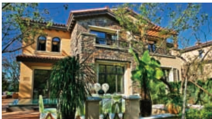
沈陽瀟山 Shenyang Rose & Ginkgo Villa