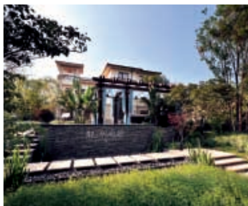
煙台原著 Yantai Longfor Splendor

The Group remunerates its employees based on their performance, work experience and the prevailing market wage level. The total compensation of the employees consisted of base salary, cash bonus and share-based rewards. Cash bonus is a large part of senior employees' cash compensation which is a function of, amongst other things, the net profit, the net profit margin and results of a balanced score card of the individual subsidiaries.