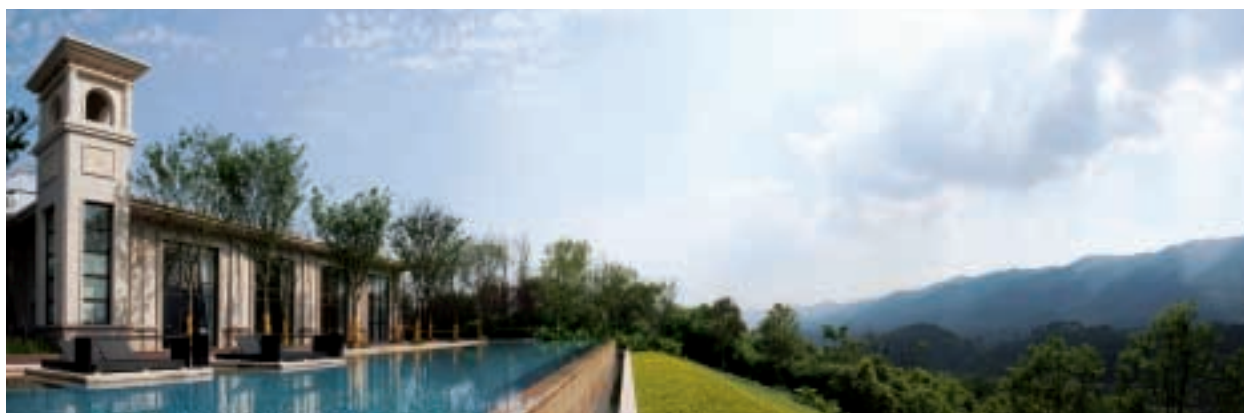
重慶紫雲台 Chongqing Hilltop's Garden

Approximately RMB9.35 billion of the Group's consolidated borrowings were quoted at fixed rates ranging from 3.08% per annum to 9.50% per annum depending on the tenors of the loans, and the rest were quoted at floating rates. As at June 30, 2012, the Group's average cost of borrowing was 6.73% per annum. The average term of loan was shortened from 4.0 years to 3.9 years. The ratio of unsecured debt to total debt was 46.5% (31 December, 2011: 46.6%). Ratio of fixed interest debt to total debt was 31.5% (31 December, 2011: 31.5%).