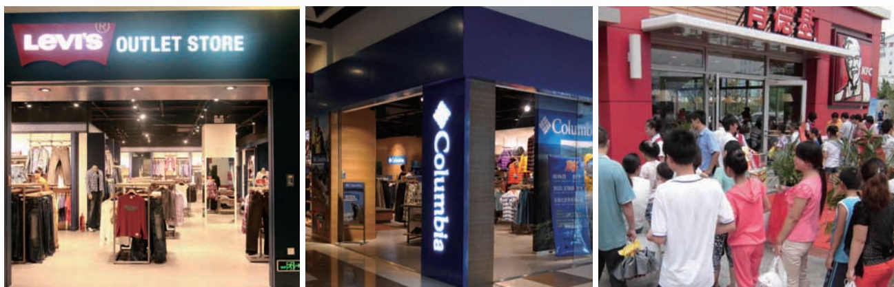
▲► Brands newly in CSC Shenzhen 新進駐深圳華南城的品牌

One of the Group's key development pillars, the Outlet Center, not only offers branded goods to end-users, but also brings in traffic flow. Located in the phase II trade center, the Outlet Center boasts a strong international brand line-up — featuring global sportswear and outdoors brands such as Nike, Adidas, Puma, Kappa, Fila, Columbia, Lotto and Li Ning — and renowned fashion, leather goods and accessories brands such as Levi's, Daniel Hechter, Le Saunda, Sanrio, G2000, Lids, Walker Shop and Baleno.