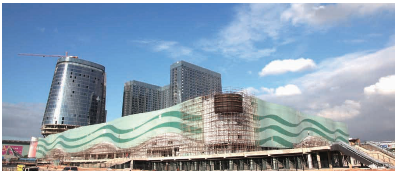
▲ Plaza 5 in CSC Shenzhen on the verge of completion 將近竣工的深圳華南城5號交易廣場

目前，深圳華南城一期涵蓋五大互補的輕工業，包括紡織及服裝、皮革及皮具、電子原材料、印刷、紙品及包裝以及五金、化工及塑膠。為配合深圳華南城及其鄰近地區的發展，本集團策略性地把二期的產品類型拓展至半成品、製成品、小商品、主題商品及廠商直銷奧特萊斯中心。二期亦已劃分為茶葉及茶具中心、港貨直銷中心、燈飾中心、內衣交易中心、男士服裝、女士服裝、兒童服裝及兒童用品、家居廣場、乾貨中心、奧特萊斯中心等。