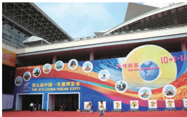
▲ The China — ASEAN Light Industrial Product Fair at CSC Nanning 於南寧華南城舉行之中國—東盟輕工業產品展覽會