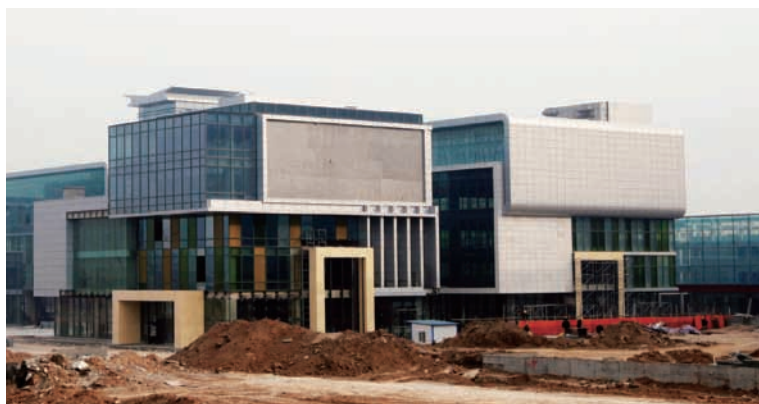
▲► Trade centers in CSC Xi'an 西安華南城交易中心

西安華南城位於陝西省西安國際港務區，內設鐵路集裝箱中心以及中國西北地區最大的保稅區，受廣泛的交通網絡覆蓋，交通非常方便。項目選址位於北三環路出口，坐擁兩條已規劃的地下鐵路線。西安華南城為本集團與深圳市豪德天成投資有限公司的合營公司，本集團擁有其中65%權益。受惠於國家策略性發展西部地區的機遇，西安華南城將打造成該地區的主要綜合商貿物流及商品交易中心，以迎合區內與日俱增的發展需求。