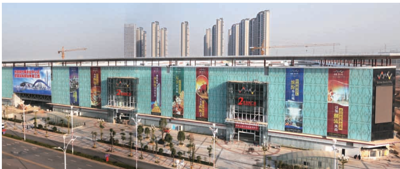
▲ The trade center and residential properties in CSC Nanchang 南昌華南城交易中心及住宅

自一期交易中心及住宅設施成功推出以來，南昌華南城繼深圳華南城成為本集團另一重要收入來源。分別定位為時裝、服裝及紡織，以及皮革皮具的交易中心與零售商舖錄得銷售收入575.5百萬港元，以平均售價13,600港元/平方米售出建築面積44,800平方米(2011/12財政年度上半年：無)。交易中心自2011年11月首次推售以來銷情熱烈，亦帶動了住宅配套設施的銷情，以平均售價6,200港元/平方米售出建築面積234,600平方米，銷售收入達1,376.5百萬港元(2011/12財政年度上半年：無)。