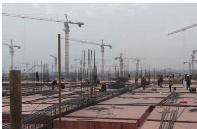
▲ CSC Zhengzhou under construction 在建中的鄭州華南城