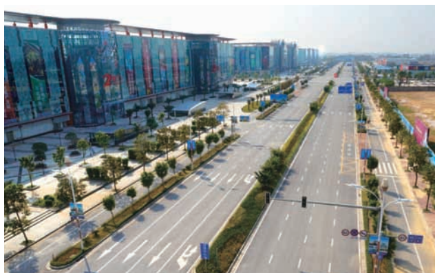
▲ Logistics Trade centers in CSC Nanning 南寧華南城物流交易中心

自物流交易中心推出以來，南寧華南城已取得不俗表現，於本期間共錄得374.5百萬港元的銷售收入，以平均售價約15,600港元/平方米售出建築面積25,500平方米(2011/12財政年度上半年：無)。