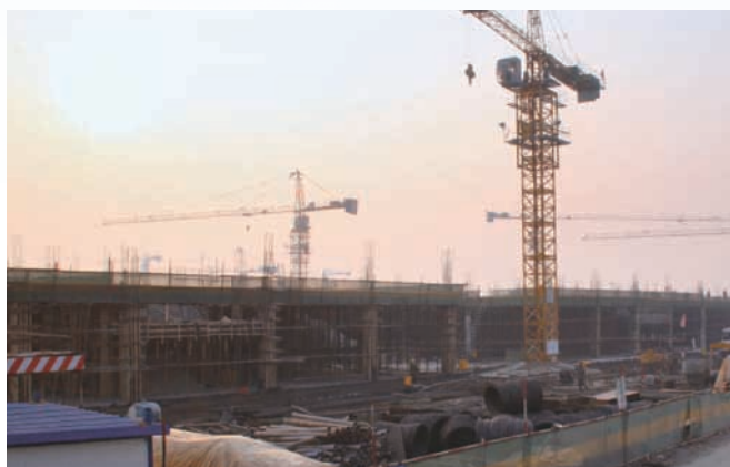
▲ CSC Harbin under construction 在建中的哈爾濱華南城