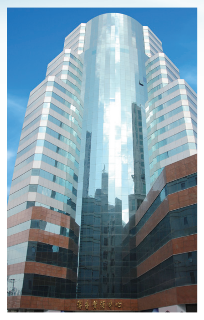
Harbour Ring Huang Pu Centre, Shanghai

Though the Shanghai's office leasing market has been climbing steadily since the trough created by the financial tsunami in 2008, the office market growth may slow down as the US economy is still recovering and European economies continue to be affected by economic and financial uncertainties. With increase in supply of office spaces in noncentral business districts in Shanghai with lower rental rates, tenants are more demanding in getting favourable lease terms and competitive rental rates. Hence, the upcoming year