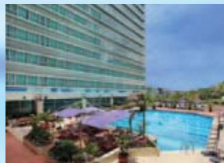
■ Outdoor Swimming Pool