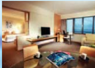
■ Deluxe Suite

9 Cheong Tat Road, Hong Kong International Airport, Chek Lap Kok, Hong Kong. Tel: (852) 2286 8888 Fax: (852) 2286 8686 Email: info@airport.regalhotel.com Website: www.regalhotel.com