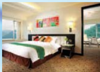
■ Deluxe Suite

34-36 Tai Chung Kiu Road, Shatin, New Territories, Hong Kong. Tel: (852) 2649 7878 Fax: (852) 2637 4748 Email: info@riverside.regalhotel.com Website: www.regalhotel.com