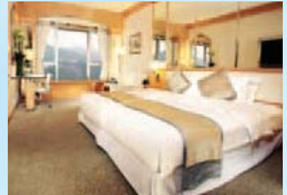
■ Deluxe Room

88 Yee Wo Street, Causeway Bay, Hong Kong. Tel: (852) 2890 6633 Fax: (852) 2881 0777 Email: info@hongkong.regalhotel.com Website: www.regalhotel.com