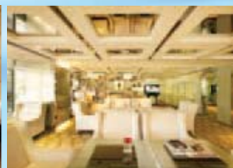
■ Executive Club Lounge