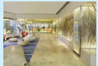
■ Hotel Lobby