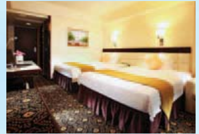
■ Executive Club Floor Suite

30-38 Sa Po Road, Kowloon City, Kowloon, Hong Kong. Tel: (852) 2718 0333 Fax: (852) 2718 4111 Email: info@oriental.regalhotel.com Website: www.regalhotel.com