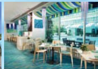
■ L'Eau Restaurant