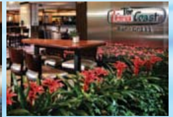
■ The China Coast Bar + Grill