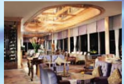
■ Zeffirino Ristorante