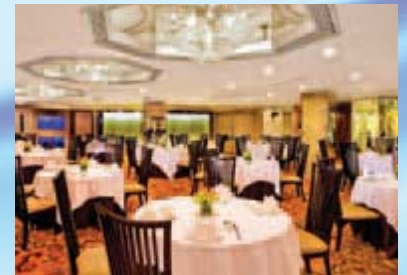
■ Regal Terrace