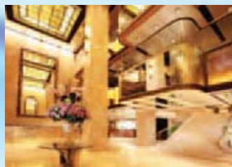
■ Hotel Lobby

71 Mody Road, Tsimshatsui, Kowloon, Hong Kong. Tel: (852) 2722 1818 Fax: (852) 2369 6950 Email: info@kowloon.regalhotel.com Website: www.regalhotel.com