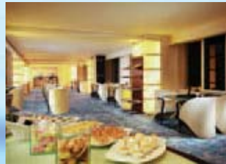
■ Executive Club Lounge