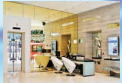
■ Hotel Lobby