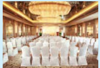
■ Regal Ballroom