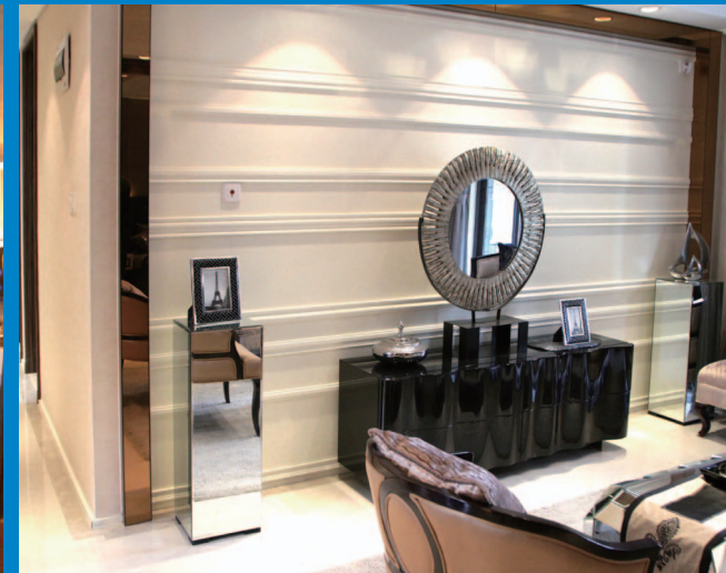
Zhangjiang Tomson Garden (Phase 4A) 張江湯臣豪園四期A標