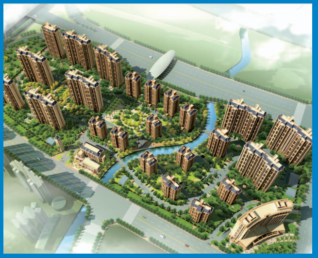
Residential-cum-Commercial Development in Fengxian District奉賢區之住宅及商業發展項目

另一方面,於二零一二年十二月三十一日,本集團持有湯臣集團有限公司(「湯臣集團」))之項。 部已發行股本中約12.1%權益,以作為一項追與 期投資。湯臣集團為一家香港上市公司,並為 上海市浦東其中一家主要房地產發展商。 區透過部份現金及部份股份方式收取湯臣集團 之二零一一年度中期股息約6,830,000港元。 集團於回顧年度之經營收益總額約2.8%。 此外,該投資之公平值變動所產生之未變現計 入本集團於二零一二年十二月三十一日之投資 重估儲備內。