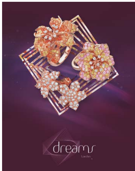
Dreams London fashion jewellery. 「Dreams London」時尚飾物。