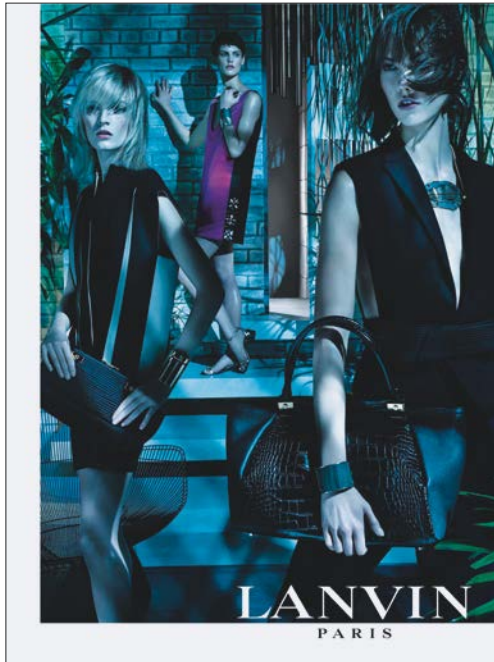
Ladieswear and leathersgoods by Lanvin. 「Lanvin」女士服裝及皮具。