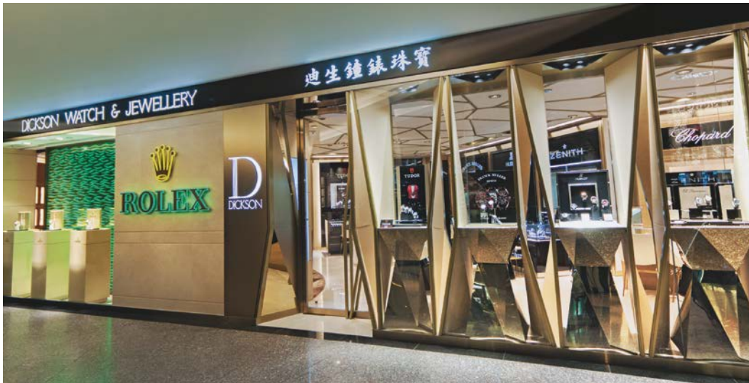
Newly renovated Dickson Watch & Jewellery boutique at Landmark, Central, Hong Kong. 位於香港中環置地廣場新裝修的「迪生鐘錶珠寶」精品店。

Various boutiques / store opened or renovated by the Group during the year.