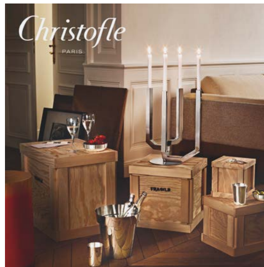
Christofle silverware. 「Christofle」銀器。