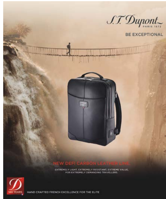
New S.T. Dupont 'Défi' carbon leathersgoods. 全新的「都彭」「Défi」碳纖維皮具。

In view of these results, the Board is recommending the payment of a final dividend of 20.0 cents per ordinary share. The final dividend together with the interim dividend of 11.0 cents per ordinary share amount to a total dividend of 31.0 cents per ordinary share. The proposed final dividend, subject to approval at the 2013 annual general meeting of the shareholders of the Company, will be payable in cash, with an option for the shareholders of the Company to receive wholly or partly in the form of new and fully paid ordinary shares in lieu of cash under the Company's Scrip Dividend Scheme. A circular with details of the Scrip Dividend Scheme and the relevant election form are expected to be despatched to shareholders on Friday, 2nd August, 2013.