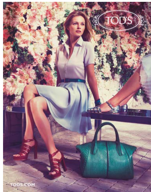
Tod's shoes and leathersgoods. 「Tod's」鞋履及皮具。