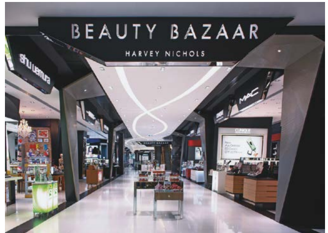
Beauty Bazaar by Harvey Nichols at The ONE, Tsimshatsui, Hong Kong. 位於香港尖沙咀「The ONE」的「Harvey Nichols」之 「Beauty Bazaar」店。