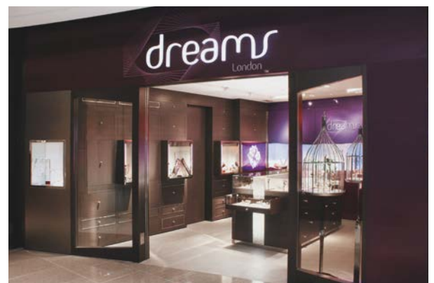
Dreams London boutique at Hysan Place, Causeway Bay, Hong Kong. 位於香港銅鑼灣希慎廣場的「Dreams London」精品店。