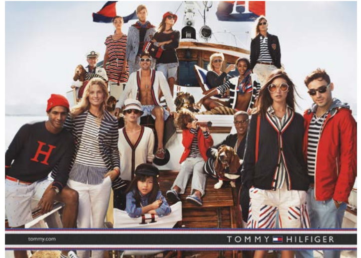
Fashionwear by Tommy Hilfiger. 「Tommy Hilfiger」時裝。

In South East Asia, we opened our second Rolex boutique in Taiwan at Mitsukoshi A9 in Taipei, and a new Tod's 3,800 sq. ft. flagship store at Taipei 101. In Taiwan, our retail network of 84 shops in prime retail locations throughout the island ensures the Group is well positioned to capture consumer spending there. In Singapore, a new duplex Dickson Watch & Jewellery store of 1,600 sq. ft. was opened at Wisma Atria, bringing our retail network in Singapore and Malaysia to 24 stores.