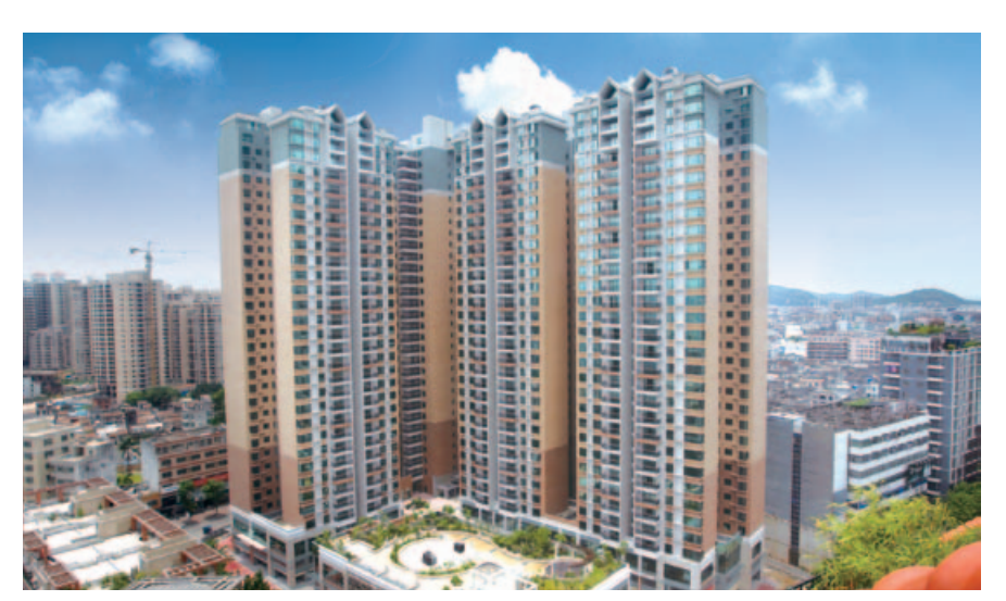
"Le Palais Royal", Shanwei City, Guangdong Province