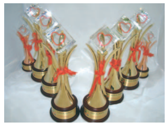
Safety Performance Awards