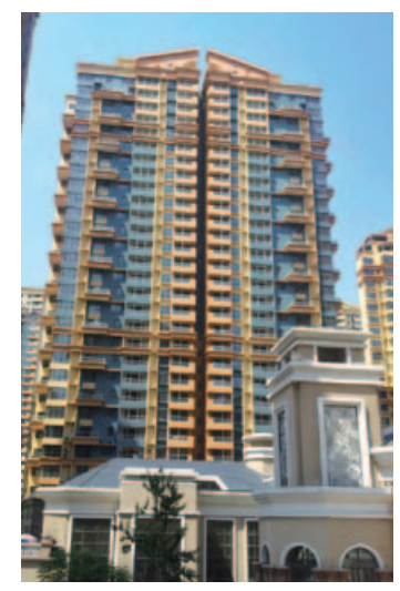
"Arc de Royal", Tower 8, Shijiazhuang, Hebei Province

Meanwhile, solid sales were registered at "Le Palais Royal" in Shanwei, Guangdong Province. By 31 March 2013, 89% of the residential units and 90% of the retail units had been sold. Elsewhere, the commercial land previously acquired by the Group in Shenyang, Liaoning Province, was sold at a profit.