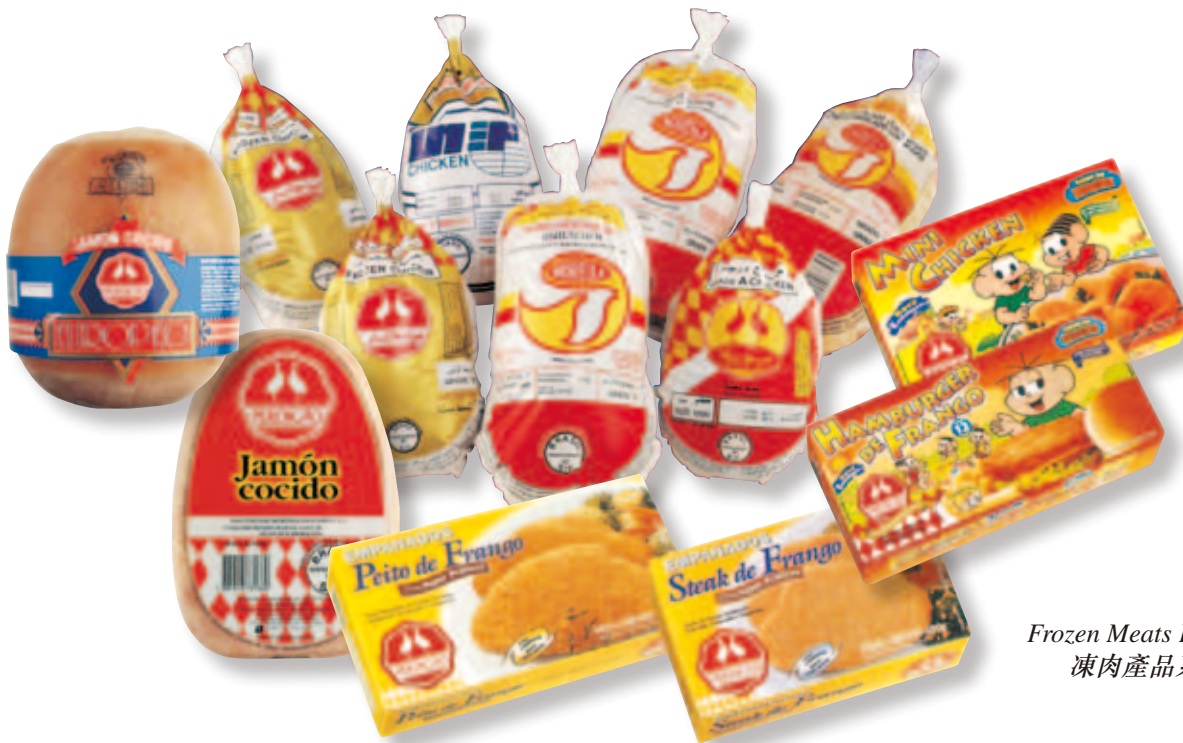
Frozen Meats Products 凍肉產品系列