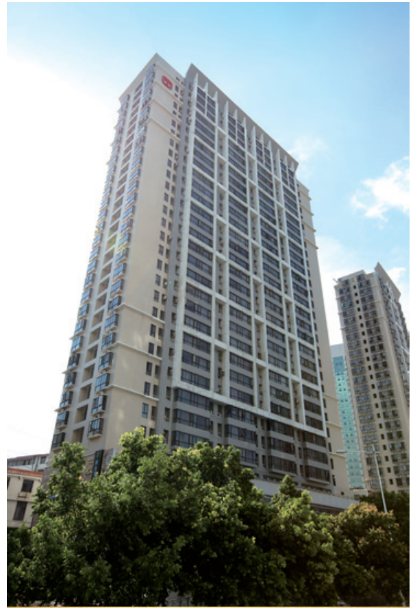
Imperial Palace 駿庭名園