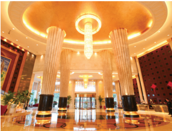
Yiyang Carrianna International Hotel 益陽佳寧娜國際大酒店

在困難的經營環境之下，酒店、酒樓及食品分部溢利仍然維持輕微增長，主要為食品業務利潤增加及管理層努力控制成本的成果。