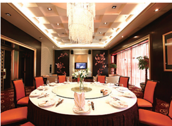
Futian Carrianna Restaurant VIP Room, Shenzhen 深圳福田佳寧娜酒樓貴賓房