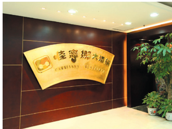
Shenzhen Carrianna Friendship Square Restaurant 深圳佳寧娜友誼廣場大酒樓