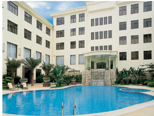
Foshan Carrianna Hotel 佛山佳寧娜大酒店