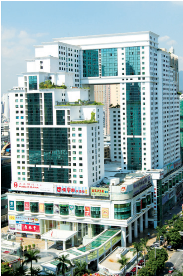
Carrianna Friendship Square 佳寧娜友誼廣場

The Group's investment properties in Shenzhen, Carrianna Friendship Square and Imperial Palace, continued to maintain high occupancy rate of over 97%. 集團在深圳的投資物業佳寧娜友誼廣場及駿庭名園仍然維持超過97%的高出租率。