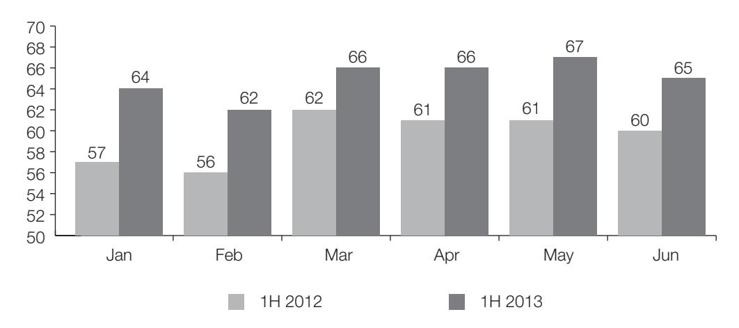
Figure 1. China's crude steel production monthly volumes (in million tonnes):

According to the World Steel Association ("WSA"), China's crude steel production reached 389 million tonnes in the first half of 2013, which represented 9% year-on-year increase compared to 356 million tonnes reported in the first half of 2012 (Figure 1).