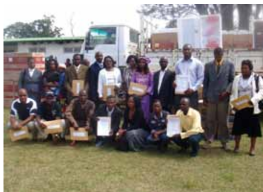
The outstanding employees of Luanshya were awarded testimonials and prizes on Labour Day