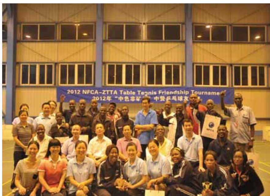
NFCA's Sino-Zambian Table Tennis Friendly Match