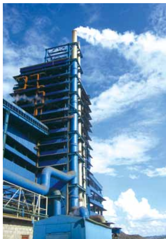
Isa furnace of CCS

The trade payables of the Group decreased by US$8.0 million from US$192.1 million as at 31 December 2012 to US$184.1 million as at 30 June 2013.