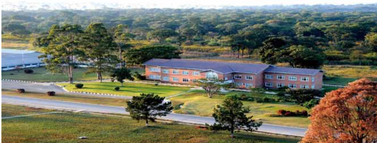
Central office building of NFA

During the reporting period, the Group promoted the establishment of a corporate chief legal consultancy system across the Company and subsidiaries. It also set up a department for legal and compliance matters, formulated the rules of procedure of the general meeting, the board of directors and the president office of China Nonferrous Mining Corporation Limited (《中國有色礦業有限公司股東大會、董事會暨總裁辦公會議事規則》), printed and published the Guidelines on Legal and Compliance Management of China Nonferrous Mining Corporation Limited (《中國有色礦業有限公司法律與合規管理工作指引》), and improved the management system of information disclosure and tracking and management procedures of related party transactions. It also designated company lawyers to organize specific trainings for all Directors, senior management and compliance personnel in respect of compliance items. All these measures improved corporate governance.