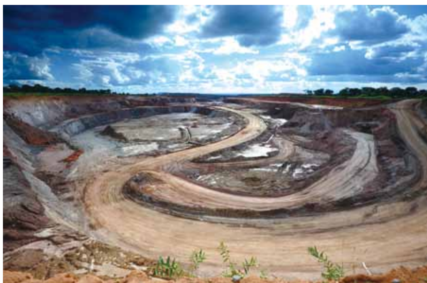
Surface mine of Muliashi Project

The remaining balance of the net proceeds has been placed in interest bearing deposit accounts with banks.