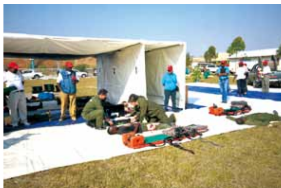
Management members of NFCA participated in the mine rescue drill competition