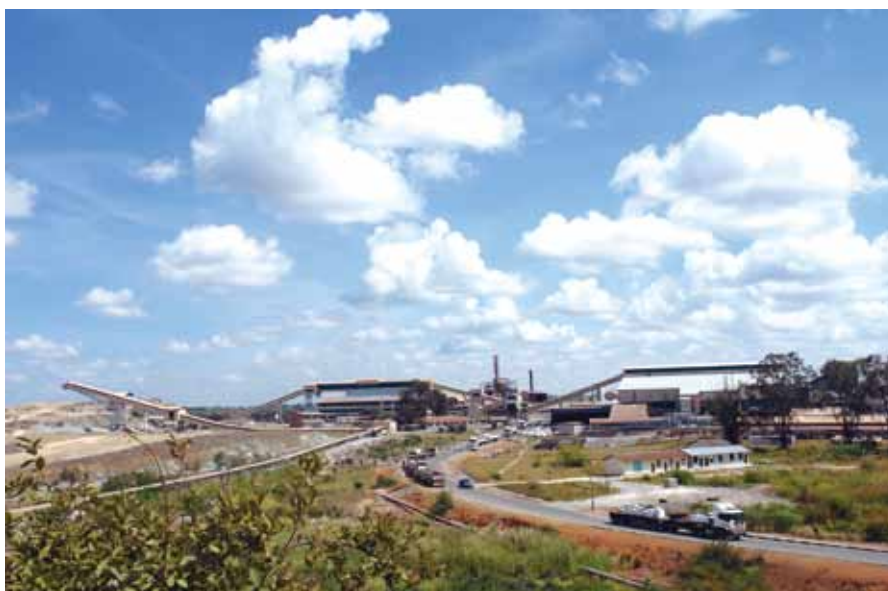
Panorama of the ore processing plant of Chambishi Copper Mine