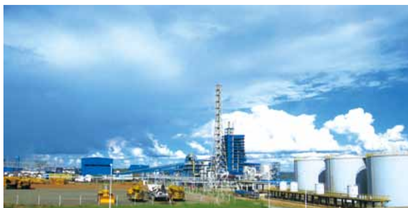
Panorama of CCS

The total capital expenditure of the Group decreased by US$7.9 million from US$133.3 million for the first half of 2012 to US$125.4 million for the first half of 2013. During the reporting period, the capital expenditure of the Group was primarily used in projects such as the Chambishi Southeast Mine Project, Muliashi Project, phase II of expansion of CCS copper smelting and Mabende copper smelting by leaching.