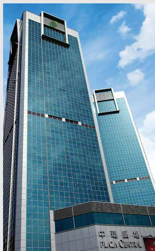
■ Plaza Central

Profit attributable to the Company's shareholders for the period amounted to HK$280.4 million (2012: HK$356.1 million), equivalent to a basic earnings per share of HK41.7 cents (2012: HK53.2 cents). The reported profit attributable to the Company's shareholders included a revaluation surplus on investment properties net of deferred taxation of HK$143.9 million (2012: HK$333.0 million). By excluding the effect of such surplus, the Group's net profit attributable to the Company's shareholders was HK$136.5 million (2012: HK$23.1 million), equivalent to a basic earnings per share of HK20.3 cents (2012: HK3.4 cents).