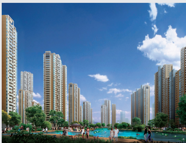
■ Nova City (prospective view)

In view of the turbulence of the worldwide finance markets, the Board will continue the conservative approach on cash management until a clearer picture is seen.