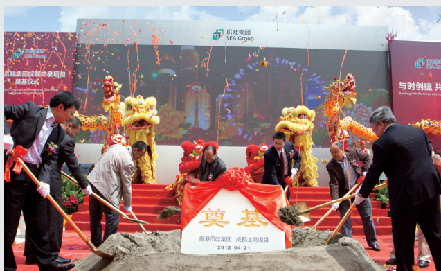
■ Longquan Project (foundation laying ceremony)

The Group submitted to the local government the master layout plan of the Longquan project, which has a site area of 506,000 square metres, in December 2012. Preliminary site works of the project have been completed and site formation works for Phase I are planned to commence in the third quarter of 2013.