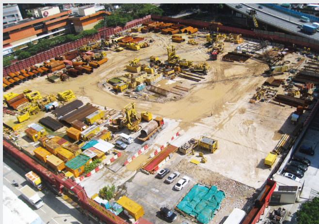
■ Fo Tan Project

The office leasing market was stable during the period. With several tenancies of Dah Sing Financial Centre, a 39-storey commercial building, being renewed at market rates, rental income received during the period increased. The occupancy rate of Dah Sing Financial Centre remains at a high level of approximately 97% as at 30 June 2013.