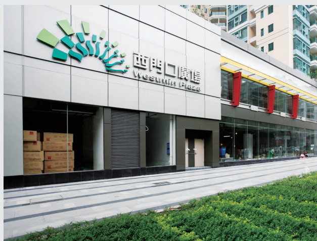
■ Westmin Plaza

Mainland China continued to experience strong economic growth with GDP growth rate maintained at 7.5% in the second quarter of 2013. The property market continues to grow with the 100 cities index recording thirteen months growth since June 2012. However, the growth momentum seems to be slowing down.