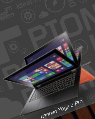
Lenovo Yoga 2 Pro