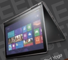
Lenovo ThinkPad Yoga