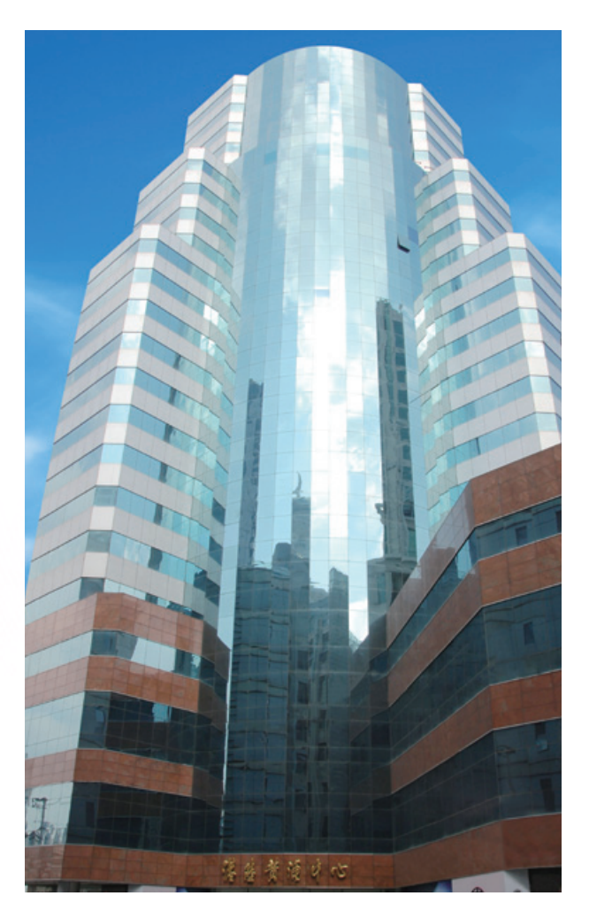
Harbour Ring Huangpu Centre, Shanghai

With the increased number of office buildings in new developing peripheral business districts in Shanghai that are close to subway lines with advanced building specifications, which in many cases are also offering attractive initial rental packages, the Group's two office and commercial properties are facing increasing competition for tenants. Management will make every effort to maintain satisfactory occupancy rate for its two properties by retaining and developing existing tenant demand, as well as to attract new tenants to the properties.