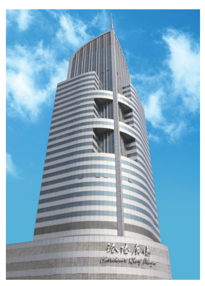
Harbour Ring Plaza, Shanghai

Revenue for the year amounted to HK$88.4 million (2012: HK$87.8 million) and earnings before interest expense and tax ("EBIT") for the year was HK$199.7 million (2012: HK$208.8 million). Excluding the write back of provisions and others relating to the disposed subsidiaries in prior years of HK$50.4 million (2012: HK$71.2 million), the recurring EBIT for the year increased by 8% from HK$137.6 million in 2012 to HK$149.3 million in 2013. The increase in recurring EBIT was mainly attributable to the increase in interest income during the year.