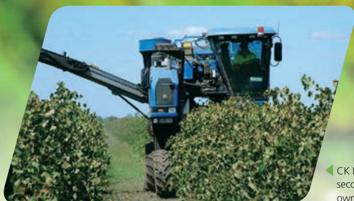
◀ CK Life Sciences is the second largest vineyard owner in Australasia.