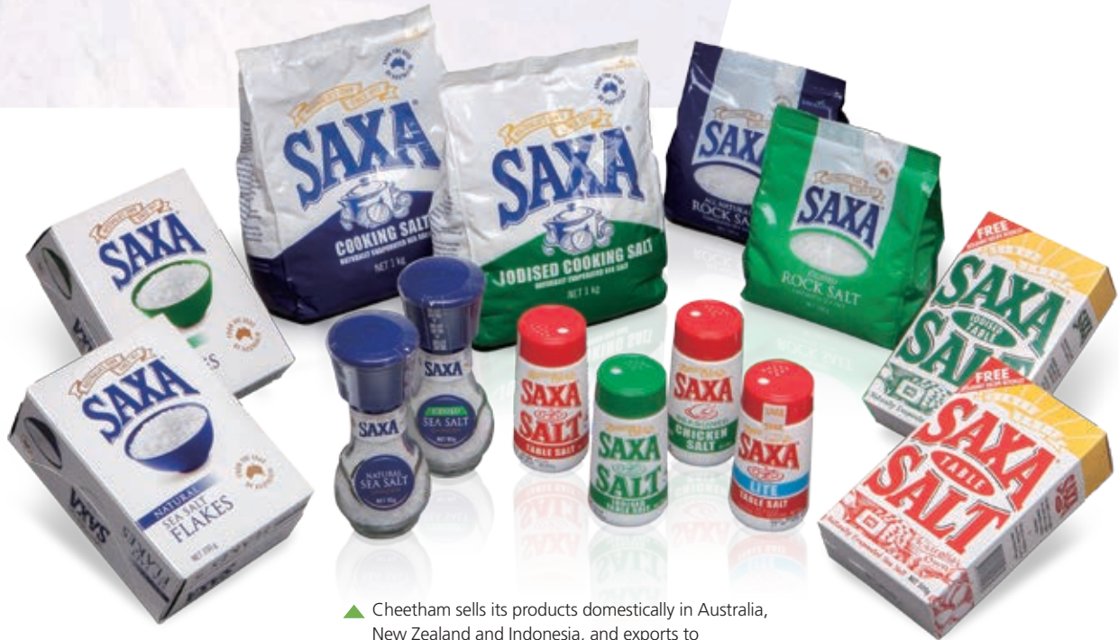
▲ Cheetham sells its products domestically in Australia, New Zealand and Indonesia, and exports to Japan, Taiwan, South Korea and China.