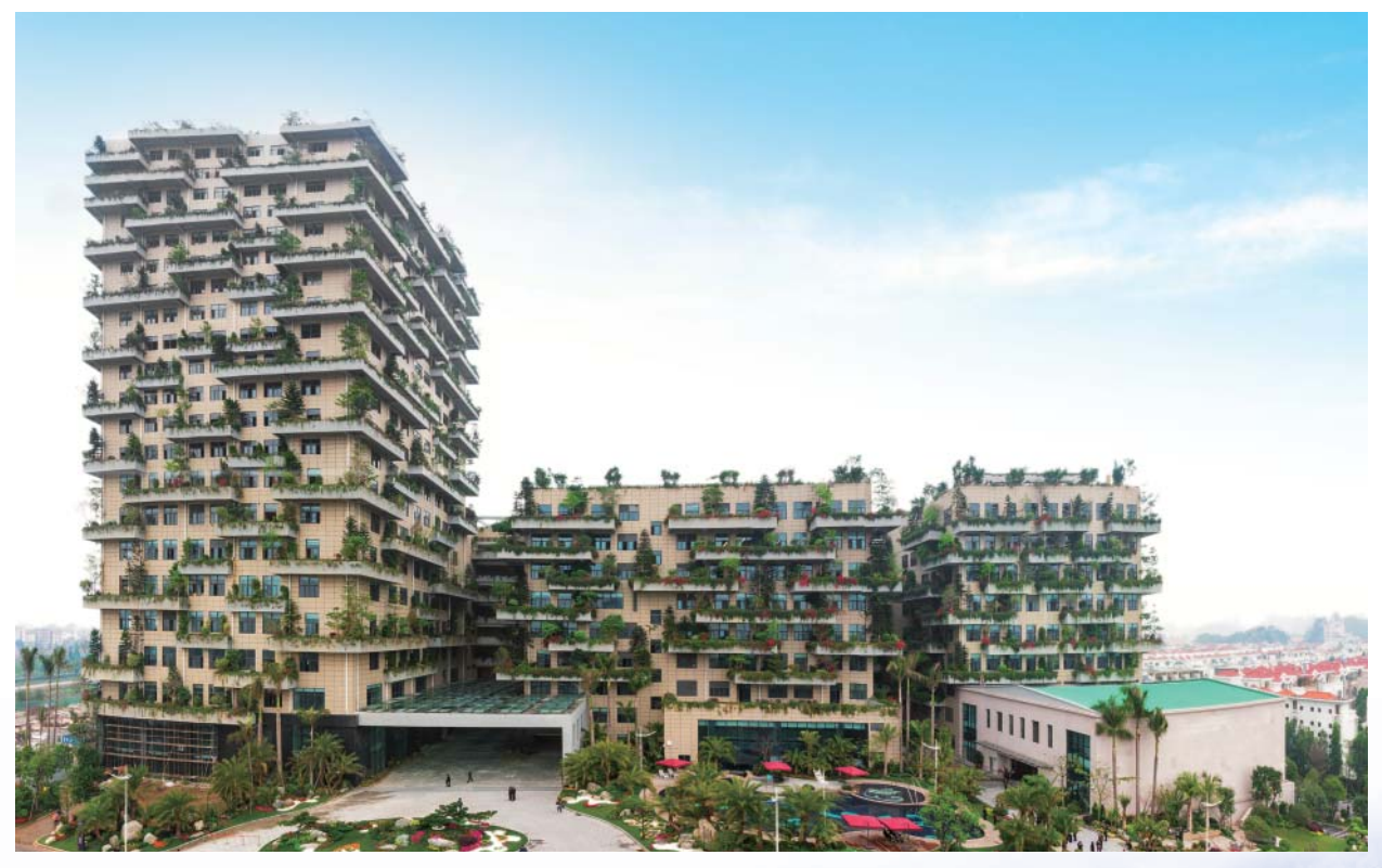
Country Garden Center

Foshan, Guangdong Province, PRC 12 March 2014