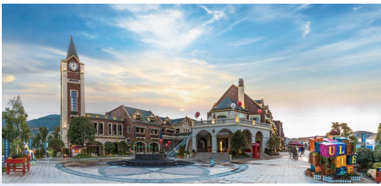
- Sanming Country Garden

Looking ahead, Country Garden will continue to focus on developing high quality property projects in the suburban areas of first tier cities as well as second and third tier cities in China with promising economic growth potential. Besides, the Group will also critically select suitable projects for development in overseas markets that Chinese people are interested to invest in. Leveraging on its unique competitive strengths, and under the direction and guidance of government's macro policies, Country Garden will further replicate its successful business model into new high growth regions through strategic selection of project locations, a short project development schedule characterized by fast asset turnover and excellent execution ability, as well as innovative product offering closely in line with market demand, all with a view to developing the Group into a leading large-scale residential property developer with a national presence and a well recognized brand name.