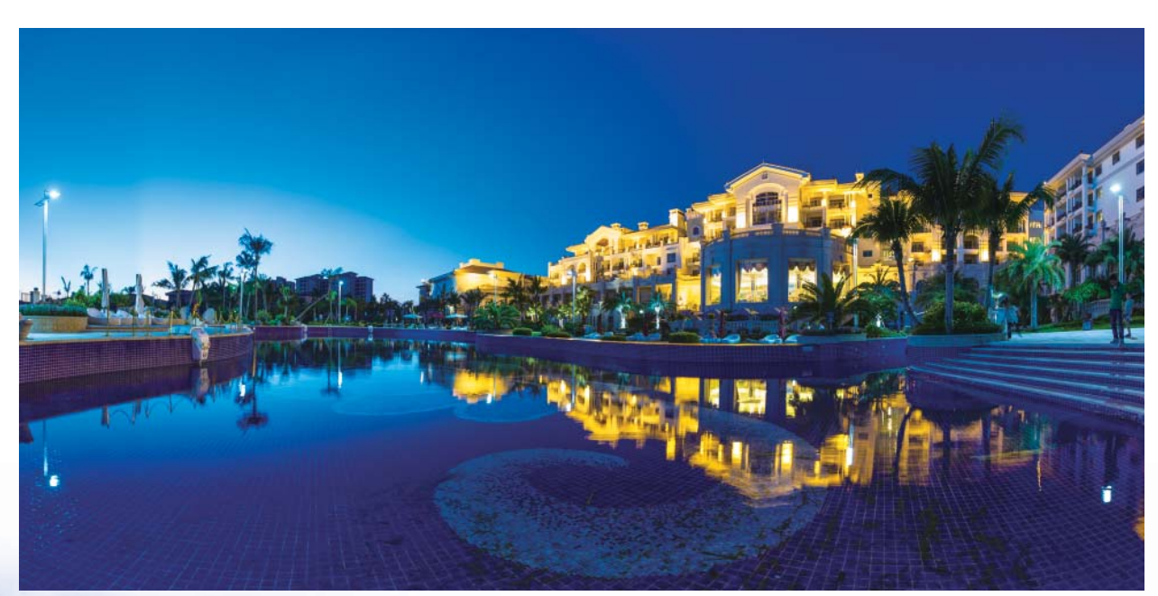
- Country Garden Phoenix Hotel, Maoming

Through a wholly-owned property service subsidiary of the Company, Guangdong Country Garden Property Service Co. Ltd. ("Guangdong Service Co."), the Group provides post sales property management and services to the residents of each of the projects developed.