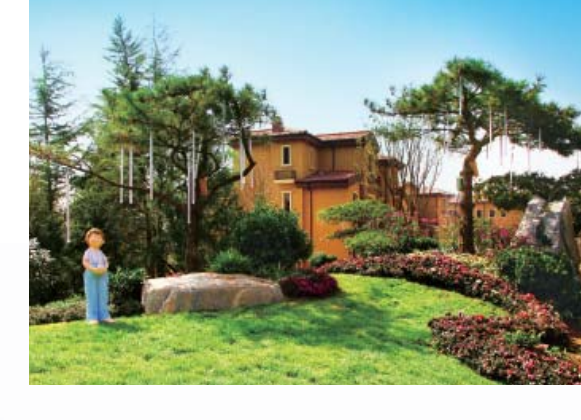
- Country Garden - Lanzhou New City