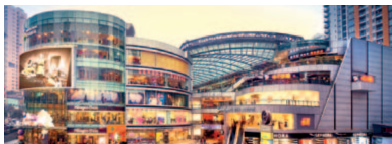
重慶北城天街 Chongqing North Paradise Walk