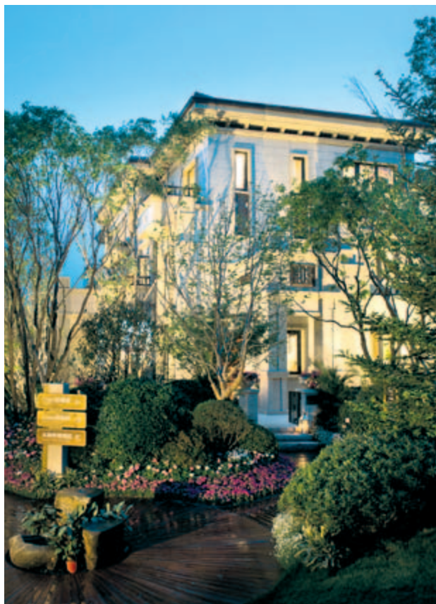
大連澗山 Dalian Rose & Ginkgo Villa