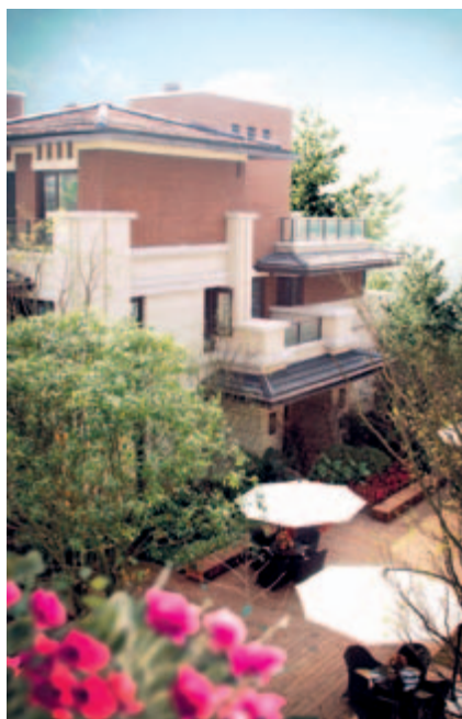
重慶東橋郡 Chongqing Toschna Villa