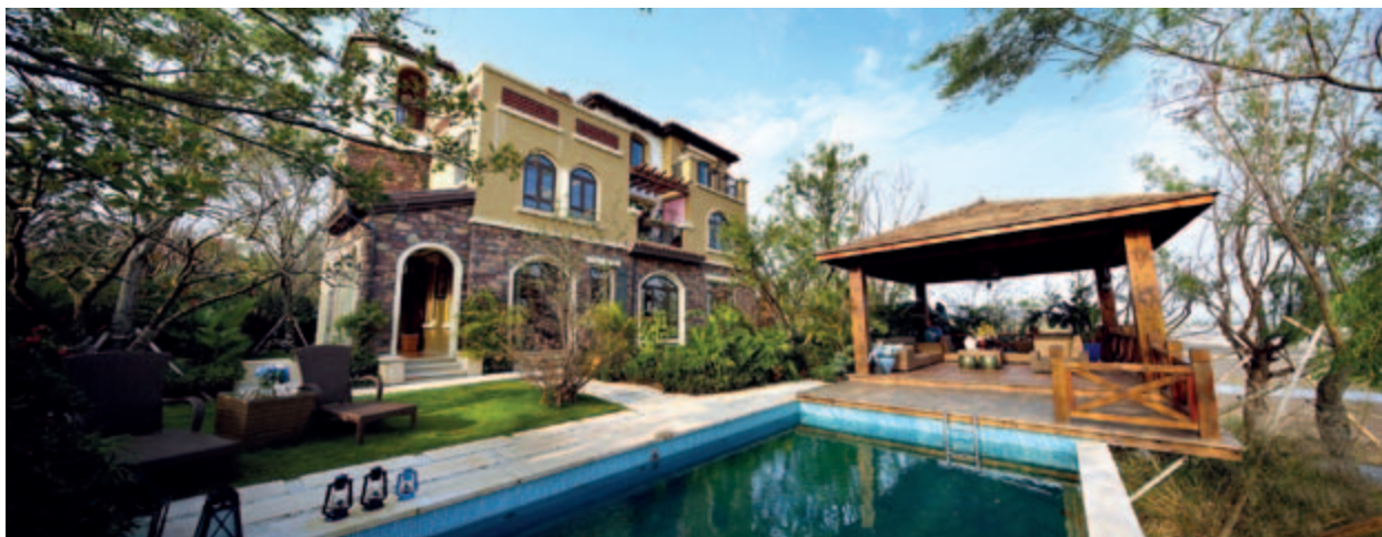
寧波澗瀾海岸 Ningbo Rose & Gingko Coast

In 2013, the Group successfully completed two financing transactions in the international capital market, which effectively extended the term of indebtedness of the Group and reduced the cost of financing. In January 2013, the Group successfully issued 10-year bonds of US$500 million at a nominal interest rate of 6.75%. The interest rate was lower than the 7-year bond issued in October 2012 at a nominal interest rate of 6.875%. In July 2013, the Group entered into a lending agreement with a syndicate of 13 banks, and obtained 4-year transferrable fixed term loan financing of HK$6,385 million and US$165 million in a total of approximately HK$7,672 million at an interest rate of Hibor plus 3.10%.