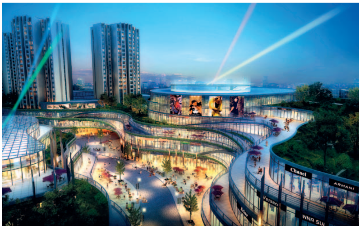
成都金楠天街 Chengdu Jinnan Paradise Walk

In 2013, revenue from property development business of the Group was RMB40.22 billion, representing an increase of 49.3% over last year. The Group delivered 4,403,376 square meters of property in GFA terms, of which 272,594 square meters were contributed from joint ventures. Gross profit margin of overall property development business decreased slightly to 27.0% in 2013 as compared with that of last year. The decrease was mainly attributable to the realization of the projects sold between the second half of 2011 and 2012 under the market fluctuation environment. Recognized average selling price was RMB9,738 per square meter in 2013.