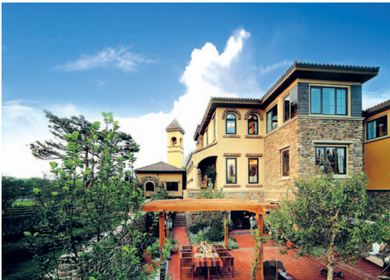
北京香醍溪岸 Beijing Chianti Riverside

Lastly, on behalf of the Board, I would like to express my sincere appreciation to all of our employees for their diligence and all of our shareholders for their support over the past year.