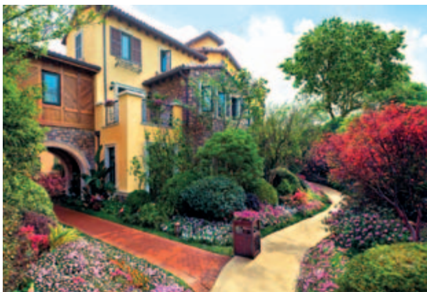
上海好望山城 Shanghai Long Xing Lu