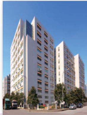
TOMSON WAIGAOQIAO INDUSTRIAL PARK 湯臣外高橋工業園區