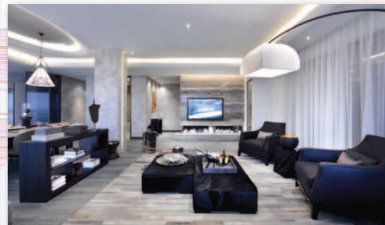
(composite diagram 組合實景圖)