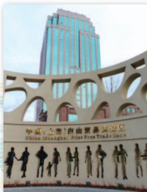
TOMSON INTERNATIONAL TRADE BUILDING 湯臣國際貿易大樓