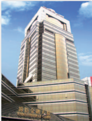
TOMSON COMMERCIAL BUILDING 湯臣金融大廈