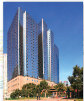
TOMSON BUSINESS CENTRE 湯臣商務中心大廈