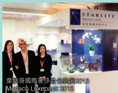
摩納哥國際奢侈品包裝展2013 Monaco Luxepack 2013