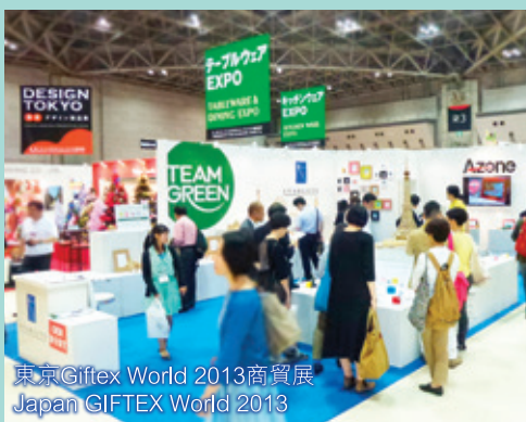
東京Giftext World 2013商貿展 Japan GIFTEX World 2013

This year, Starlite participated in Luxe Pack Exhibitions held in Monaco, Shanghai and New York, GIFTEX World Tokyo, HK Gift & Premium Fair and Cosmoprof Asia. We met some old faces and also made some new friends. We are really looking forward to the upcoming projects!