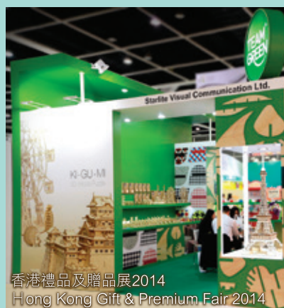
香港禮品及贈品展2014 Hong Kong Gift & Premium Fair 2014