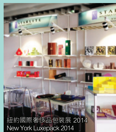
紐約國際奢侈品包裝展 2014 New York Luxepack 2014