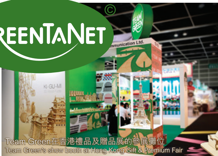
Team Green在香港禮品及贈品展的參展攤位 Team Green's show booth at Hong Kong Gift & Premium Fair