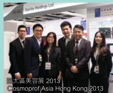
亞太區美容展 2013 Cosmoprof Asia Hong Kong 2013