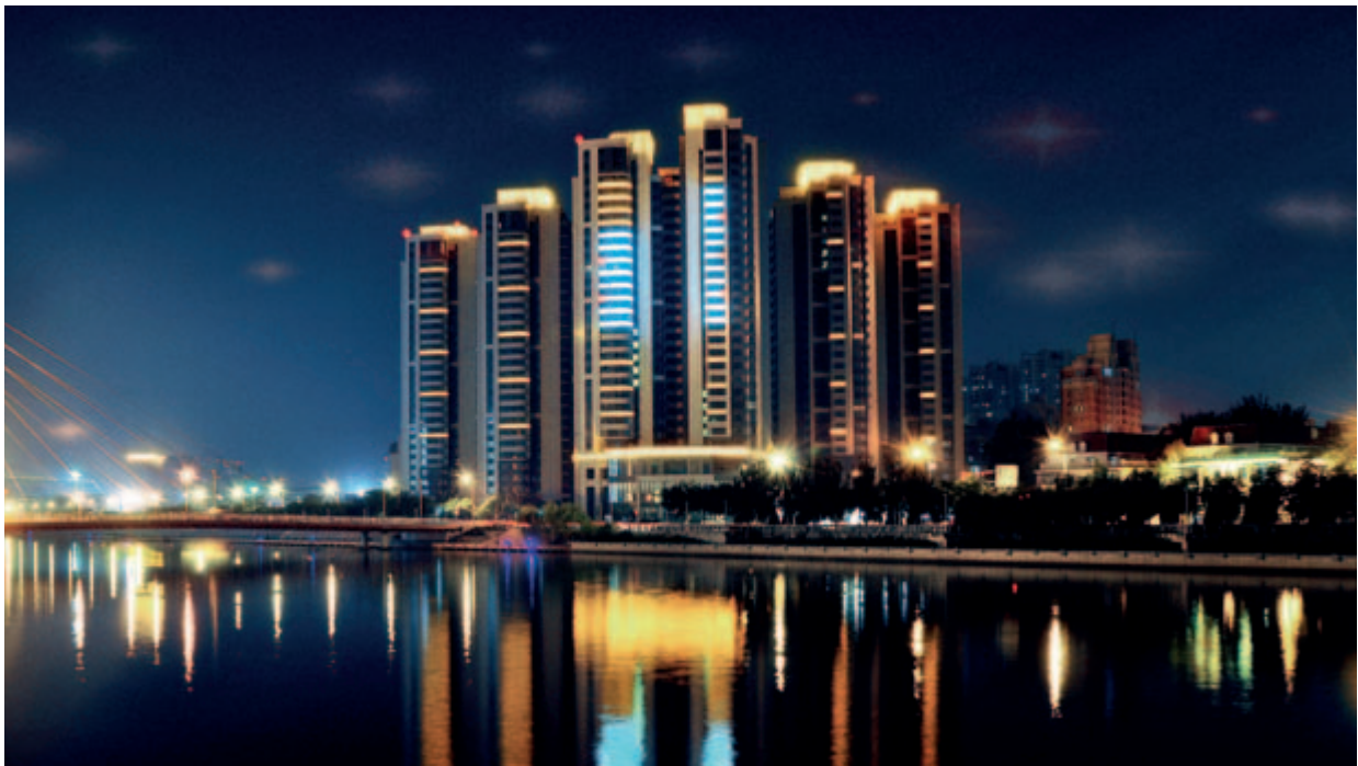
泰悦豪庭 The Riverside