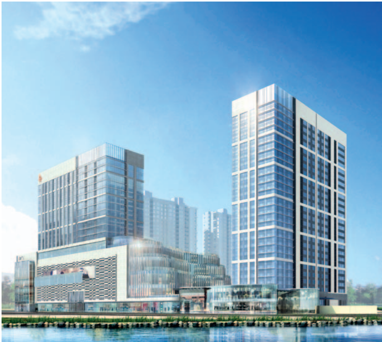
泰和龍庭 The Pinnacle

The site in Shenyang is located at Huanggu District with a site area of about 41,209 sqm and a GFA of about 165,000 sqm. The Pinnacle will comprise of both residential and commercial development. Construction works to the residential towers have commenced. All blocks (except for Towers 7 and 8) will be topped out by the end of 2014. The Group expects to commence pre-sale in the financial year of 2015 – 2016, subject to market conditions.