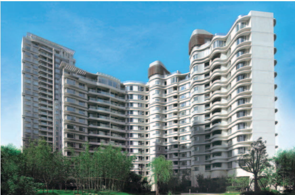
泰欣嘉園 The Waterfront