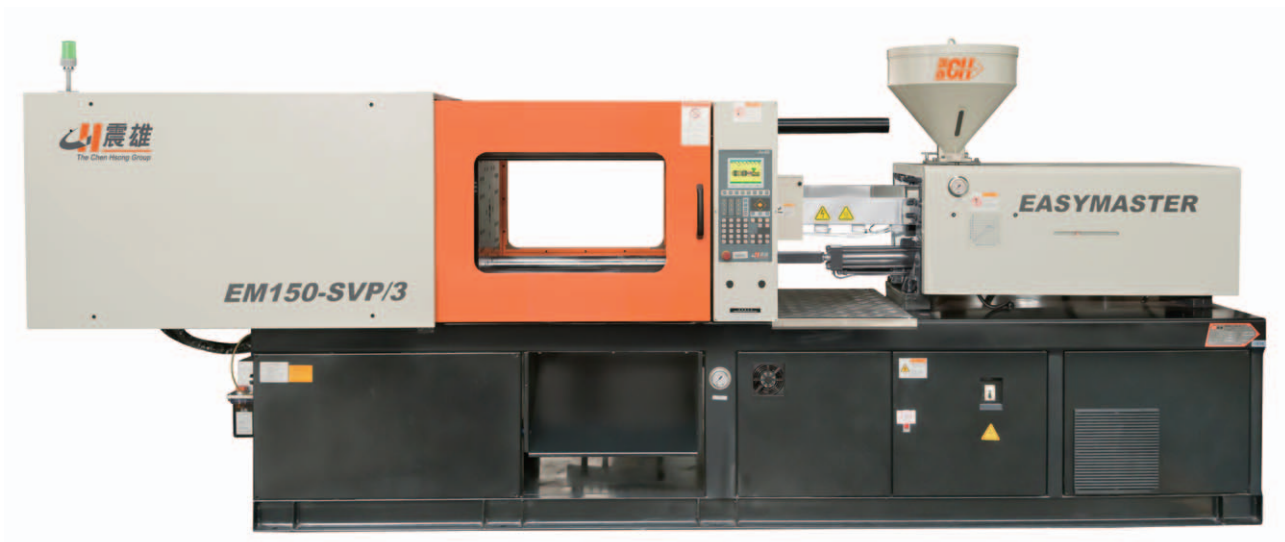
易霸第三代伺服驅動節能注塑機 EASYMASTER Third Generation Servo Drive Energy-saving Injection Moulding Machine

The Group also started a number of optimisation projects for its existing range of small and medium-sized injection moulding machines. A new generation of product lines will be introduced in the near future, sure to lead the market once again as the existing products had.