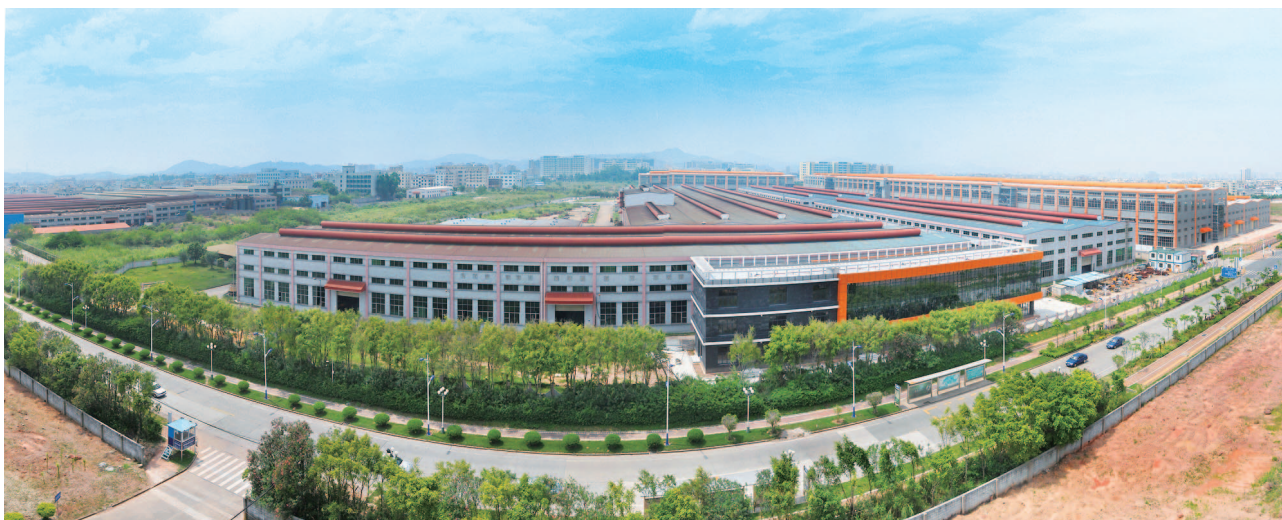
震雄旗艦生產基地－震雄工業園(深圳)

The third-stage development project of the Shenzhen Industrial Park is complete, with three large two-storey factory buildings ready for installing production equipment. The new factories provide around 83,000 m 2 of operating space primarily for manufacturing ultra-large-tonnage injection moulding machines of over 4,000-ton. The Group shall put these facilities on-line as market conditions demand.