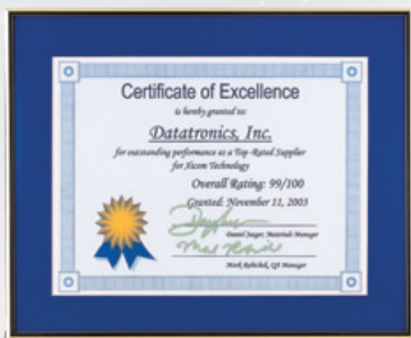
XICOM "Outstanding Performance"