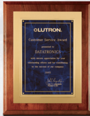
LUTRON "Customer Service"