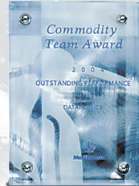
MEDTRONIC "Outstanding Performance"