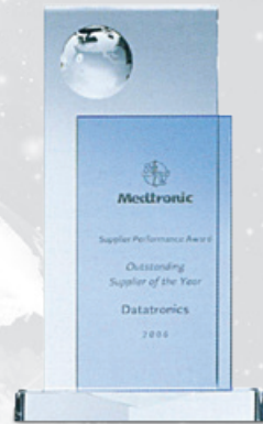
MEDTRONIC "Supplier of the Year"