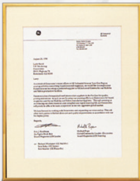
Preferred supplier General Electric