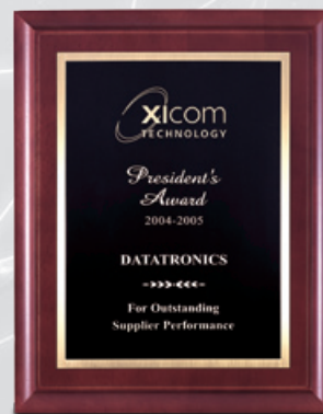
XICOM "President's Award"