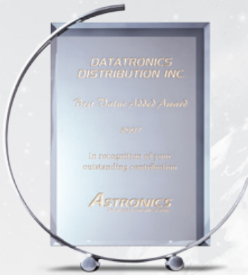
ASTRONICS "Best Value Added"