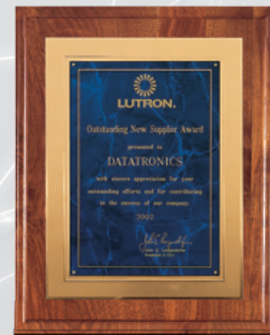
LUTRON "Outstanding New Supplier"