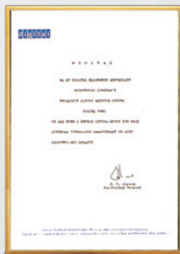
Digital Equipment corp