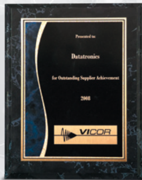
VICOR "Outstanding Supplier Achievement Award"