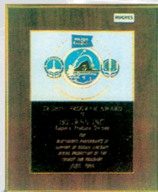
Hughes Aircraft General Motors