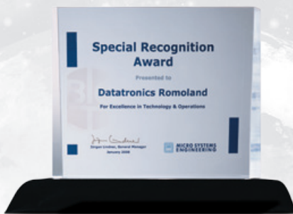
MICRO SYSTEMS ENGINEERING "Special Recognition Awards"