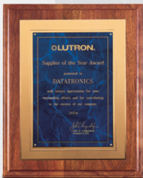
LUTRON "Supplier of the Year"