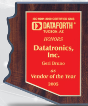
DATAFORTH "Vendor of the Year"