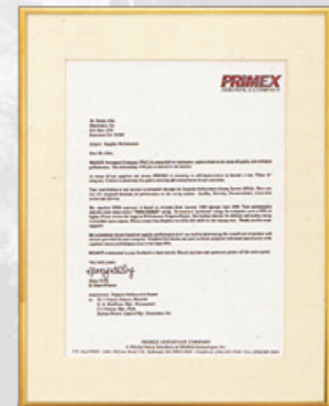
Preferred supplier Primex Aerospace