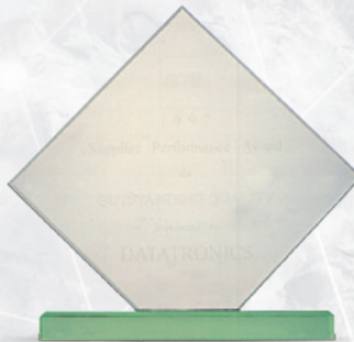
Physio Control (Div. of Medtronic)