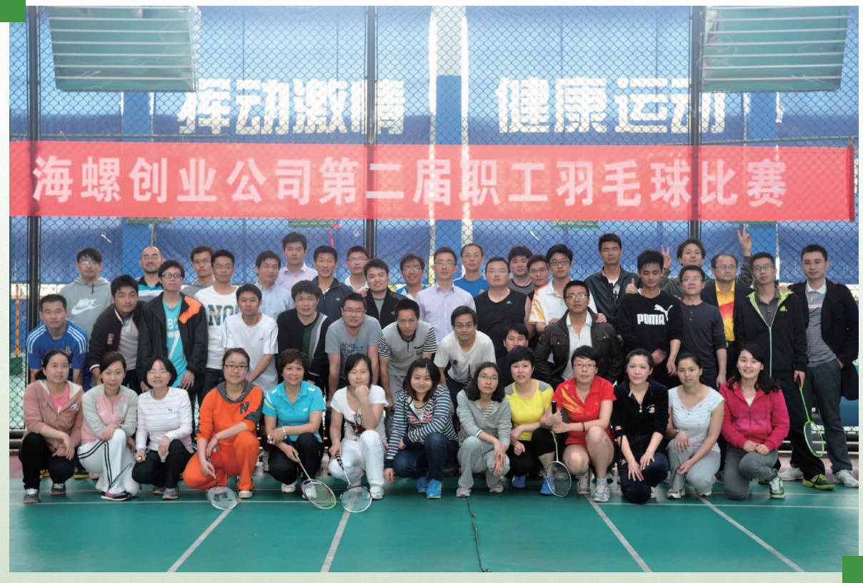
The Company organised various leisure activities for employees

Since the listing of the Group, no share option had been granted under the Share Option Scheme.