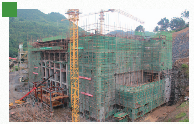
Waste incineration project in Zunyi under construction