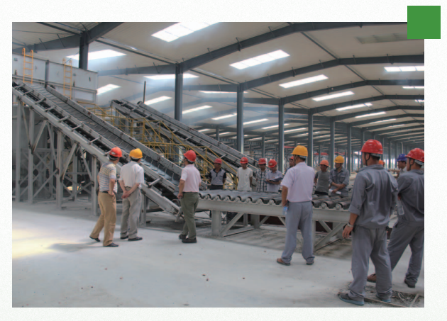
The new building materials project in Bozhou is undergoing individual equipment trial tests