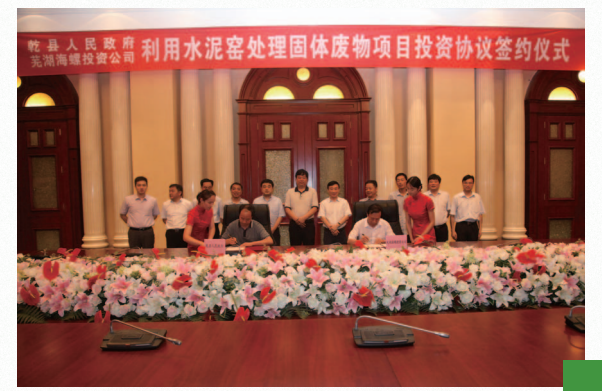
The People's Government of Qian County, Shaanxi Province and the Group entered into an investment agreement for the disposal project of solid waste by cement kilns

During the Reporting Period, the Group facilitated the development of energy-preservation and environmental-protection industries and accelerated the construction progress of new building materials projects in Bozhou and Wuhu. The two projects are expected to commence operation in September and December of 2014, respectively. While ensuring the project progress, the Group also carried out various preparatory works such as formulating marketing strategies, recruiting staff and training employees.