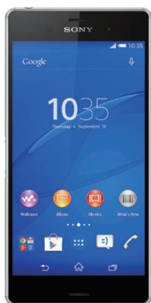
Sony Xperia Z3

Finance costs excluding exchange loss/gain increased by $44 million to $184 million (2012/13: $140 million) driven by higher bank borrowings, full-year impact of the finance costs related to the US$200 million 10-year guaranteed notes which was issued in April 2013.