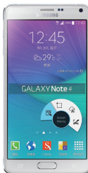
Samsung GALAXY Note4