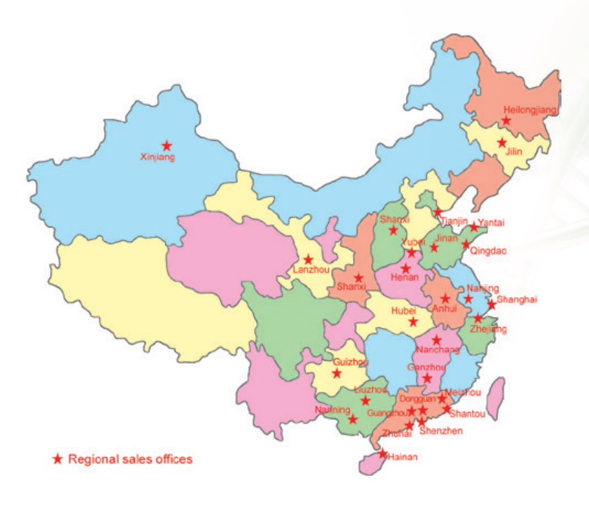
Sales and distribution network of the Group

The vision of Essex Bio-Technology Limited (the "Company") and its subsidiaries (collectively referred to as the "Group") is to be a great and socially responsible corporation. Strategically, the Group is in pursuit of innovations in bio-technology and pharmaceuticals to enhance the efficacy of healing and wellness of patients.