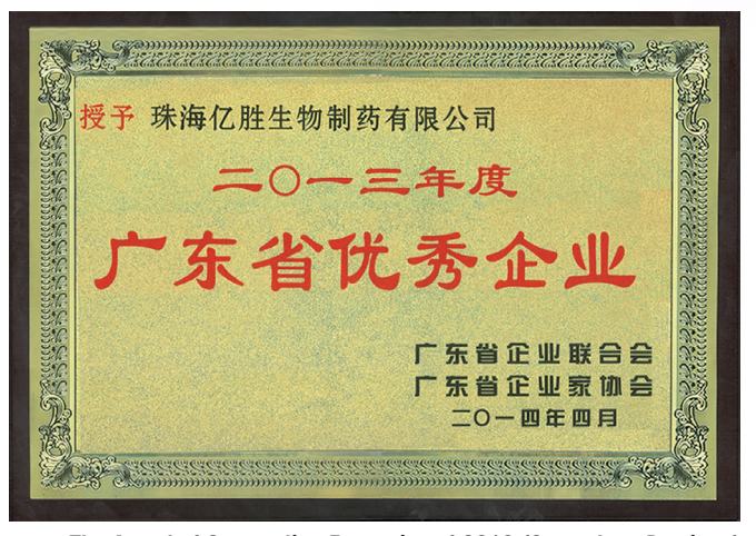
The Award of Outstanding Enterprise of 2013 (Guangdong Province)

Zhuhai Essex won the award of "Outstanding Enterprise of 2013 (Guangdong Province)".