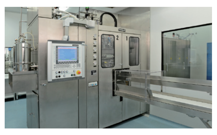
Blow-Fill-Seal production plant

The new factory in Zhuhai is fully equipped with seven production plants. One of which is for the production of active pharmaceutical ingredients – the bFGF. Four others are for the production of our flagship pharmaceutical formulations and the remaining two are the state-of-the-art Blow-Fill-Seal production plants for the production of preservative-free single dose drugs which are currently pending for the production certificate from CFDA.